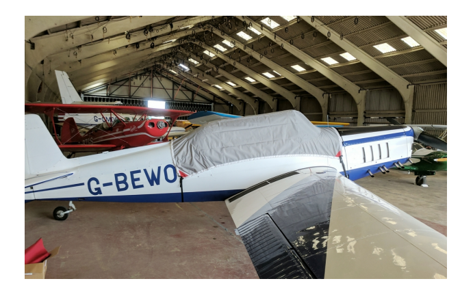
Zlin 326 Travel Cover