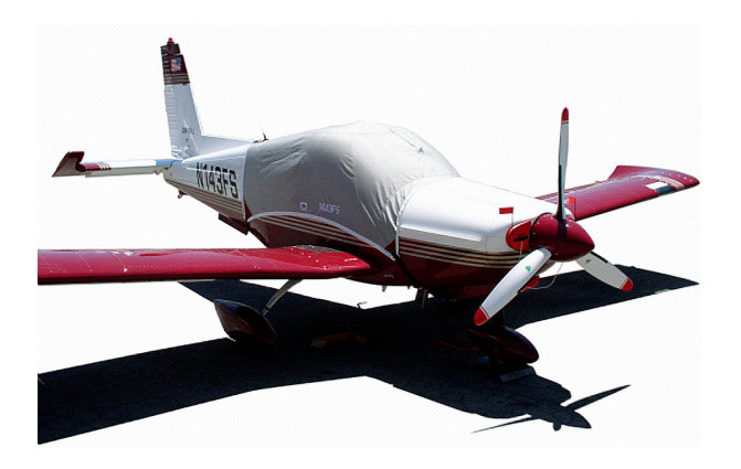
Zlin 143 Canopy Cover and Engine Plugs

the hottest of days. It is water, ice and snow repellent, yet breathable to allow moisture to escape from between the cover and the aircraft surface.