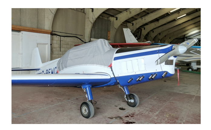
Zlin 326 Travel Cover