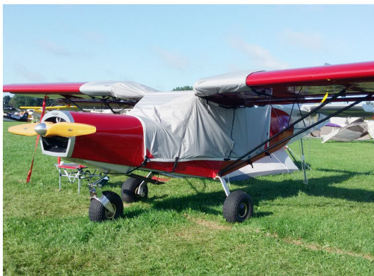
Zenith 701 Travel Canopy with wing extensions to cover gas caps.

This cover type is made from Silver Acrylic Sunbrella canvas and is 100% lined with a soft and smooth microfiber. Bruce's Custom Covers developed this material combination especially for aircraft protection. The outer material is medium weight and treated for water resistance, UV resistance and anti-static buildup. The inner lining is a very soft and smooth microfiber to prevent scratching. The material is very reflective, and tests show that the cabin interior temperature can be reduced to near-ambient temperature on the hottest of days. It is water, ice and snow repellent, yet breathable to allow moisture to escape from between the cover and the aircraft surface.