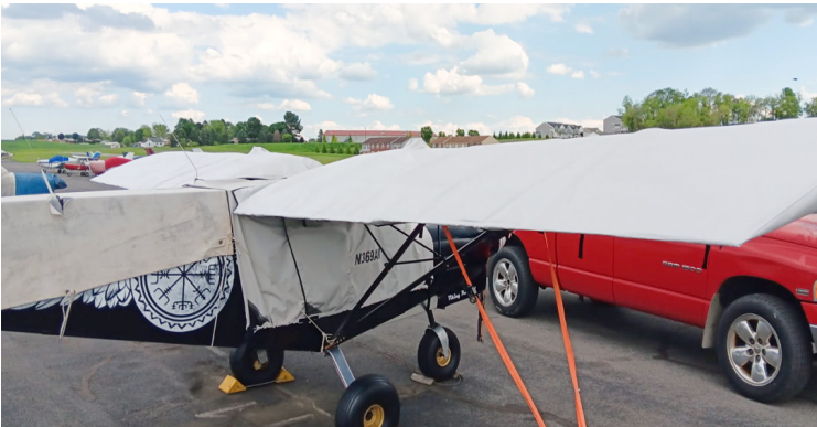
Zenith 701 Canopy Cover, Wing Covers, Padded For Hail Protection, All Year Use