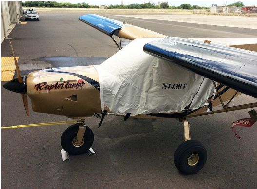
Zenith 801 Insulated Engine, Canopy, Wing & Tail Covers Zenith Zenair 701 Extended Canopy Cover (Over-The-Top Style)