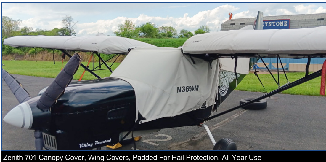
Zenith 701 Canopy Cover, Wing Covers, Padded For Hail Protection, All Year Use