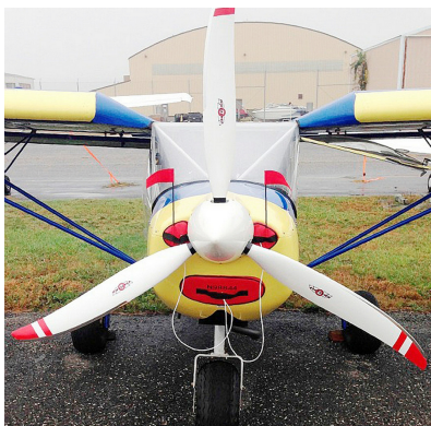
Zenith 701 Engine Inlet Plugs

Engine Inlet Plugs are custom fit for your Zenith Zenair 701 intakes, made with heavy-duty vinyl material, and stuffed with a single block of sculpted urethane foam. Each plug has a zipper that allows the foam to be removed and dried if necessary. Engine plugs have warning flags that are visible from the cockpit or 'remove before flight' streamers sewn onto the face of the plugs. Most plugs are imprinted with the aircraft registration number in black for an extra charge. Storage bag NOT included. Engine plugs may be inserted after flight when the engine is still warm. Engine Inlet Plugs are commonly referred to as Cowl Plugs, Intake Plugs, Cowl Blocks, Engine Blocks, and Engine Bungs.