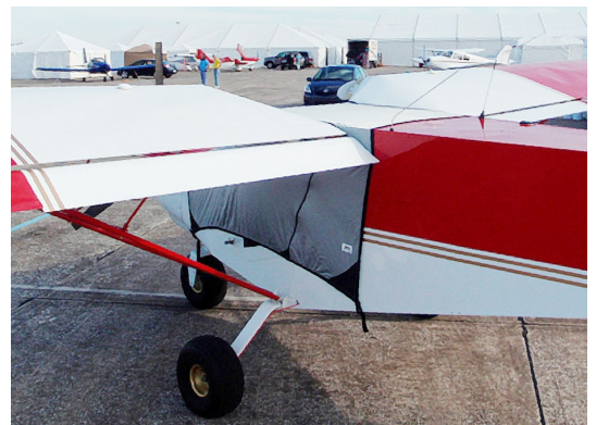
Zenith 701 Spandex FlyAway Travel Canopy Cover