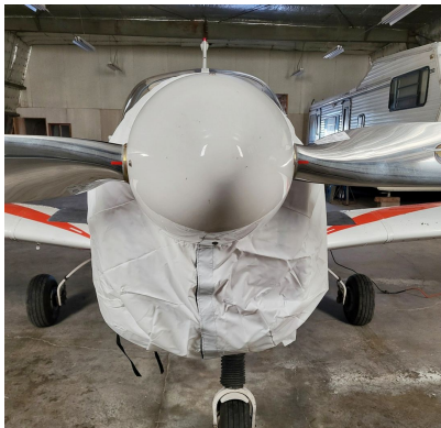
Zlin 142C Engine Cover, test fit cover

This cover type is made from Silver Acrylic Sunbrella canvas and is 100% lined with a soft and smooth microfiber. Bruce's Custom Covers developed this material combination especially for aircraft protection. The outer material is medium weight and treated for water resistance, UV resistance and anti-static buildup. The inner lining is a very soft and smooth microfiber to prevent scratching. The material is very reflective, and tests show that the cabin interior temperature can be reduced to near-ambient temperature on the hottest of days. It is water, ice and snow repellent, yet breathable to allow moisture to escape from between the cover and the aircraft surface.