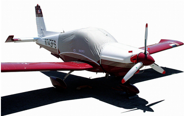
Zlin 143 Canopy Cover and Engine Plugs