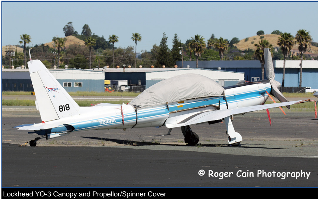
Lockheed YO-3 Canopy and Propellor/Spinner Cover