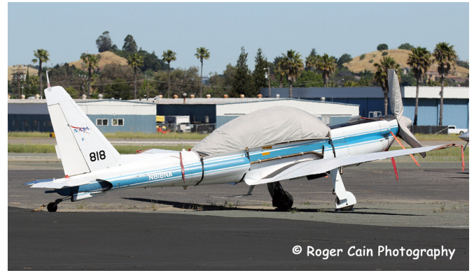
Lockheed YO-3 Canopy and Propellor/Spinner Cover