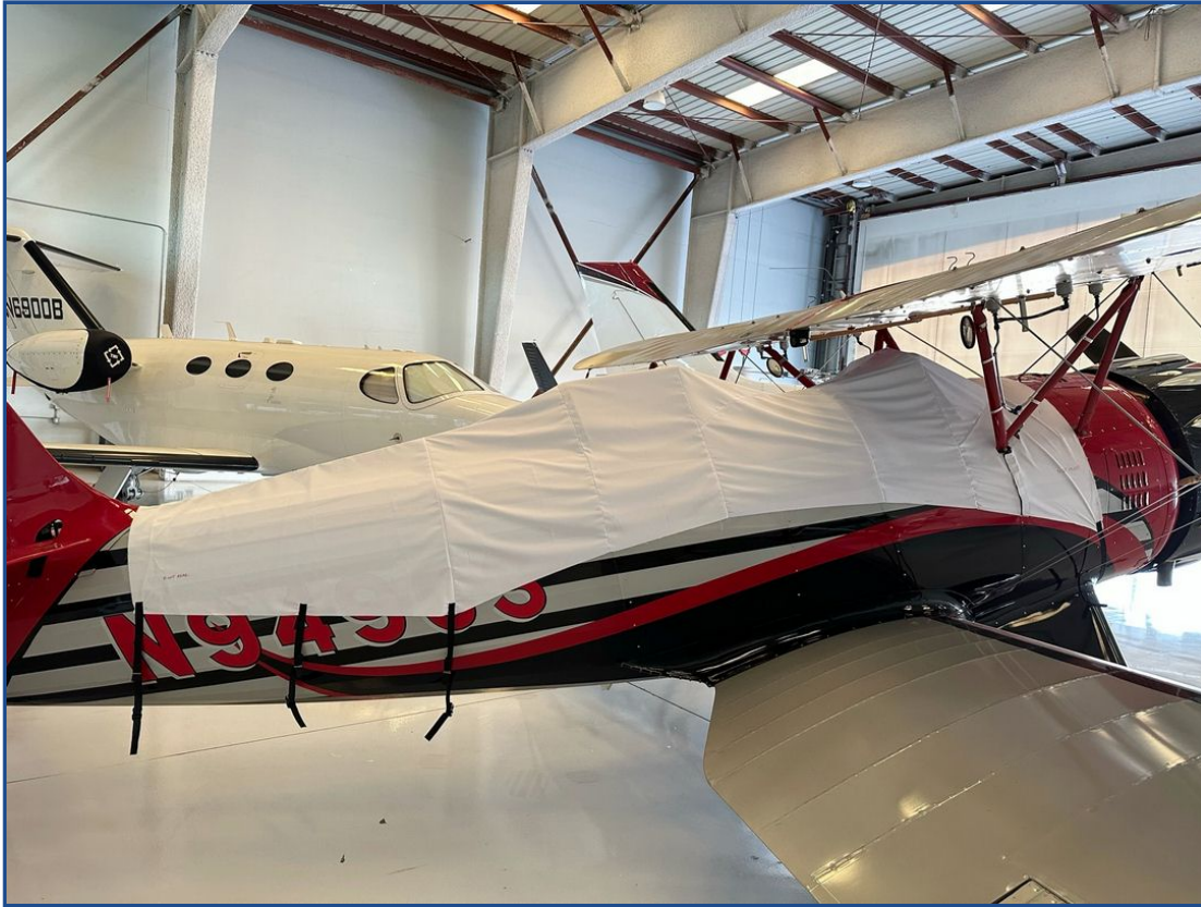
Waco YMF-5 Canopy with Turtledeck Extension, test fit cover