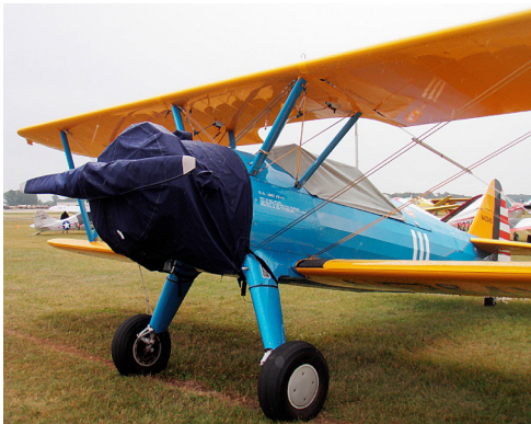
Stearman Canopy, Engine & Prop Covers

This cover type is made from Silver Acrylic Sunbrella canvas and is 100% lined with a soft and smooth microfiber. Bruce's Custom Covers developed this material combination especially for aircraft protection. The outer material is medium weight and treated for water resistance, UV resistance and anti-static buildup. The inner lining is a very soft and smooth microfiber to prevent scratching. The material is very reflective, and tests show that the cabin interior temperature can be reduced to near-ambient temperature on the hottest of days. It is water, ice and snow repellent, yet breathable to allow moisture to escape from between the cover and the aircraft surface.