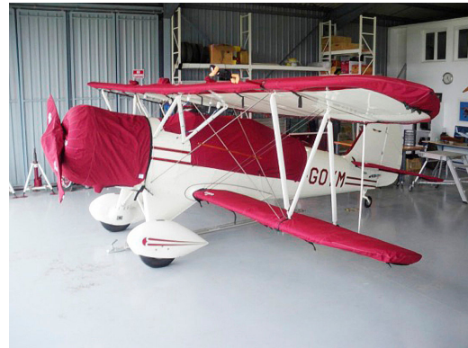
Waco UPF-7 Canopy, Wings, Stab's, Engine, Prop Covers