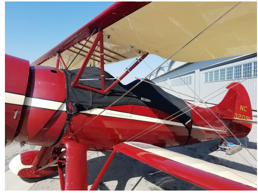
Waco UPF-7 Canopy Cover