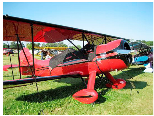
Waco UPF7 Canopy Cover