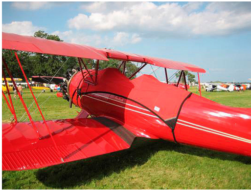
Waco UPF7 Canopy Cover