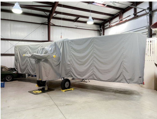
Stearman PT-13 Full Body Dust Cover, Prop Cover Included

Some high value aircraft end up logging lots of hangar time, and become dust magnets in the process. A high quality, well fitting dust cover provides easy assurance that the aircraft's surfaces remain clean and free of grit and grime. Available in a large variety of colors, each dust cover is custom made according to aircraft details and customer preferences. Fire retardant fabrics are also available.