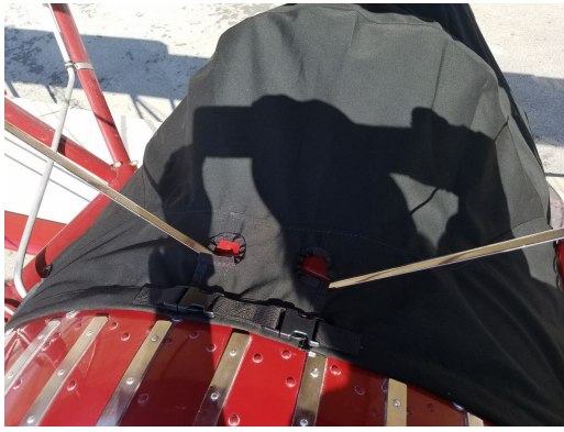
Waco UPF-7 Canopy Cover