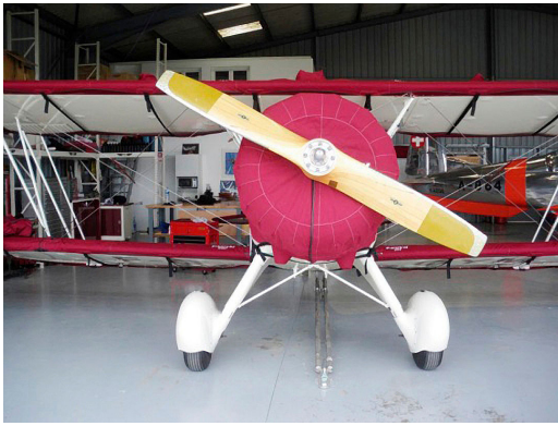
Waco UPF-7 Engine Cover