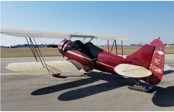
Waco UPF-7 Canopy Cover