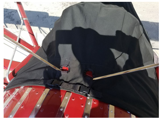
Waco UPF-7 Canopy Cover