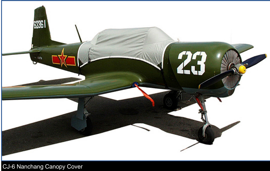
CJ-6 Nanchang Canopy Cover