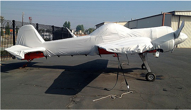
Yak 50 Insulated Hangar Blanket. 3D model Yak 55 Full Fuselage Cover w/ Detachable Wing Covers & Propellor/Spinner Cover