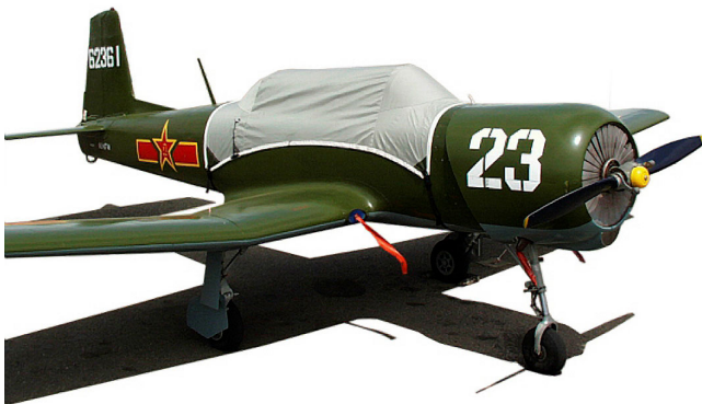
CJ-6 Nanchang Canopy Cover

This cover type is made from Silver Acrylic Sunbrella canvas and is 100% lined with a soft and smooth microfiber. Bruce's Custom Covers developed this material combination especially for aircraft protection. The outer material is medium weight and treated for water resistance, UV resistance and anti-static buildup. The inner lining is a very soft and smooth microfiber to prevent scratching. The material is very reflective, and tests show that the cabin interior temperature can be reduced to near-ambient temperature on the hottest of days. It is water, ice and snow repellent, yet breathable to allow moisture to escape from between the cover and the aircraft surface.