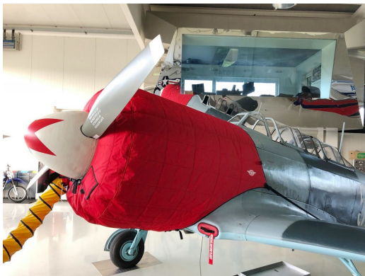
Yak 11 Insulated Engine Cover & Oil Cooler Inlet Plug

This cover type is made from Silver Acrylic Sunbrella canvas and is 100% lined with a soft and smooth microfiber. Bruce's Custom Covers developed this material combination especially for aircraft protection. The outer material is medium weight and treated for water resistance, UV resistance and anti-static buildup. The inner lining is a very soft and smooth microfiber to prevent scratching. The material is very reflective, and tests show that the cabin interior temperature can be reduced to near-ambient temperature on the hottest of days. It is water, ice and snow repellent, yet breathable to allow moisture to escape from between the cover and the aircraft surface.