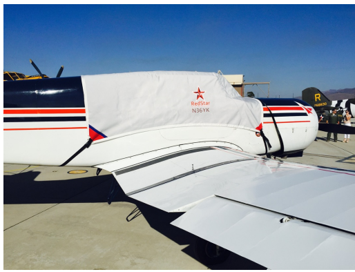
Yak 18 Canopy Cover