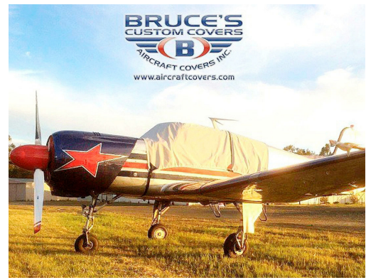
Yak 18 Canopy Cover