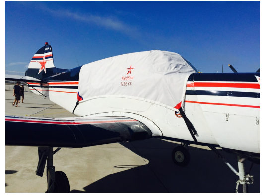
Yak 18 Canopy Cover