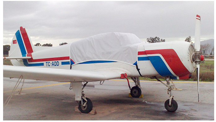
Yak 18 Canopy Cover