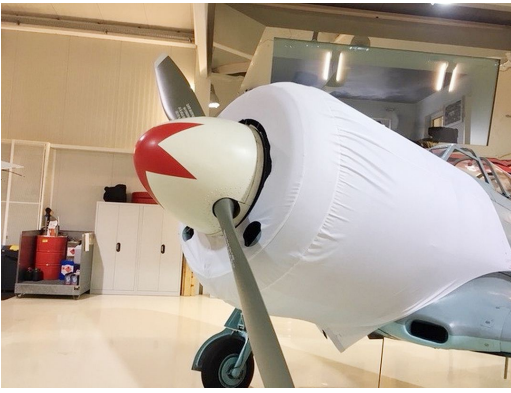
Yak 11 Engine Cover (test fit cover)