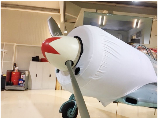
Yak 11 Engine Cover (test fit cover)