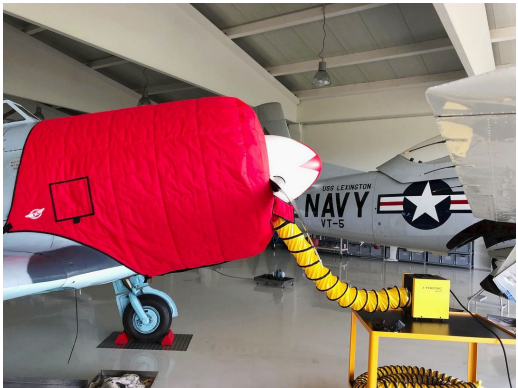
Yak 11 Insulated Engine Cover