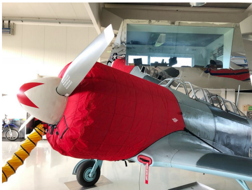
Yak 11 Insulated Engine Cover & Oil Cooler Inlet Plug

Engine Inlet Plugs are custom fit for your Yakovlev Yak 11 intakes, made with heavy-duty vinyl material, and stuffed with a single block of sculpted urethane foam. Each plug has a zipper that allows the foam to be removed and dried if necessary. Engine plugs have warning flags that are visible from the cockpit or 'remove before flight' streamers sewn onto the face of the plugs. Most plugs are imprinted with the aircraft registration number in black for an extra charge. Storage bag NOT included. Engine plugs may be inserted after flight when the engine is still warm. Engine Inlet Plugs are commonly referred to as Cowl Plugs, Intake Plugs, Cowl Blocks, Engine Blocks, and Engine Bungs.