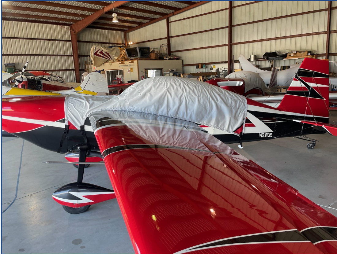
Laser Z2300 Canopy Cover