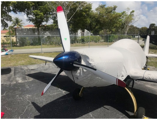
Extra 300/L Full Body Cover

This cover type is made from Silver Acrylic Sunbrella canvas and is 100% lined with a soft and smooth microfiber. Bruce's Custom Covers developed this material combination especially for aircraft protection. The outer material is medium weight and treated for water resistance, UV resistance and anti-static buildup. The inner lining is a very soft and smooth microfiber to prevent scratching. The material is very reflective, and tests show that the cabin interior temperature can be reduced to near-ambient temperature on the hottest of days. It is water, ice and snow repellent, yet breathable to allow moisture to escape from between the cover and the aircraft surface.