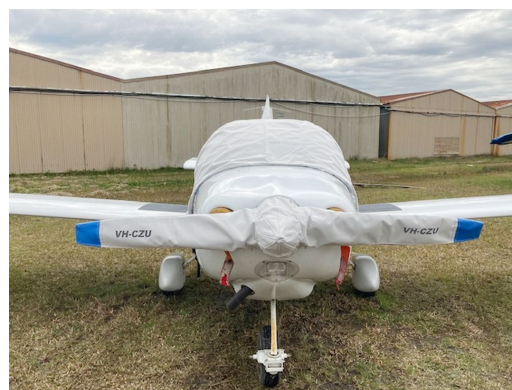
XL-2 PROPELLOR/SPINNER COVER