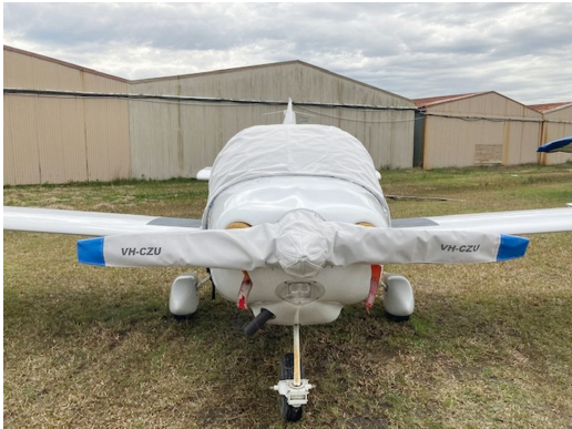
XL-2 PROPELLOR/SPINNER COVER

This cover type is made from Silver Acrylic Sunbrella canvas and is 100% lined with a soft and smooth microfiber. Bruce's Custom Covers developed this material combination especially for aircraft protection. The outer material is medium weight and treated for water resistance, UV resistance and anti-static buildup. The inner lining is a very soft and smooth microfiber to prevent scratching. The material is very reflective, and tests show that the cabin interior temperature can be reduced to near-ambient temperature on the hottest of days. It is water, ice and snow repellent, yet breathable to allow moisture to escape from between the cover and the aircraft surface.