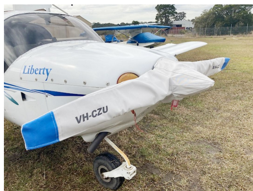
XL-2 PROPELLOR/SPINNER COVER

This cover type is made from Silver Acrylic Sunbrella canvas and is 100% lined with a soft and smooth microfiber. Bruce's Custom Covers developed this material combination especially for aircraft protection. The outer material is medium weight and treated for water resistance, UV resistance and anti-static buildup. The inner lining is a very soft and smooth microfiber to prevent scratching. The material is very reflective, and tests show that the cabin interior temperature can be reduced to near-ambient temperature on the hottest of days. It is water, ice and snow repellent, yet breathable to allow moisture to escape from between the cover and the aircraft surface.