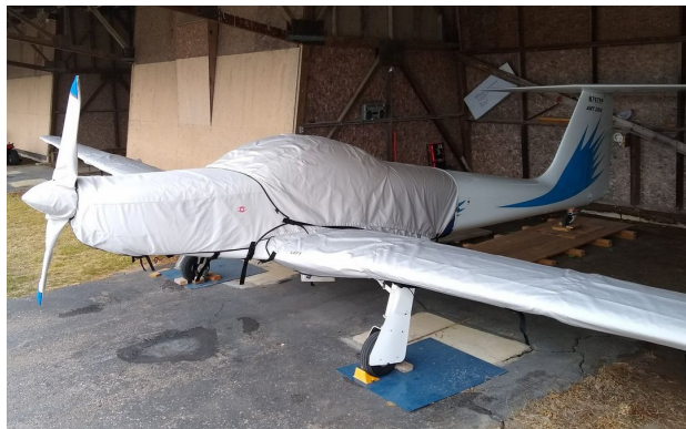
Aeromot Ximango Extended Canopy Cover, Engine, Prop & Wing Covers