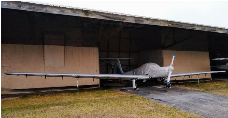
Aeromot Ximango Extended Canopy Cover, Engine, Prop & Wing Covers