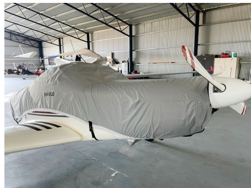
Ximango Travel Weight Canopy/Engine Cover