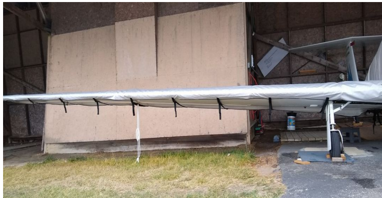
Aeromot Ximango Wing Covers

WINTER USE MATERIAL - Made with Solution-Dyed Polyester fabric, this option is intended for seasonal use to aid in deicing, rain mitigation, or for occasional travel. The material is lighter and more compact, but more susceptible to UV damage and may have a shorter useful life if used continuously outside than the all-year use material.