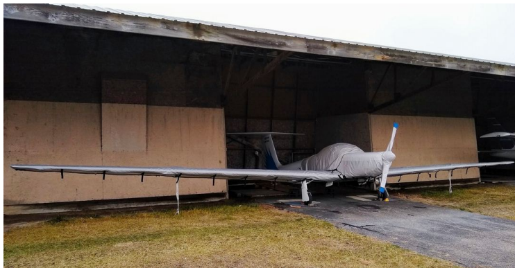
Aeromot Ximango Extended Canopy Cover, Engine, Prop & Wing Covers