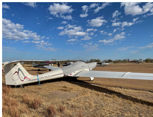
Ximango AMT Light Weight Travel Canopy/Engine Cover