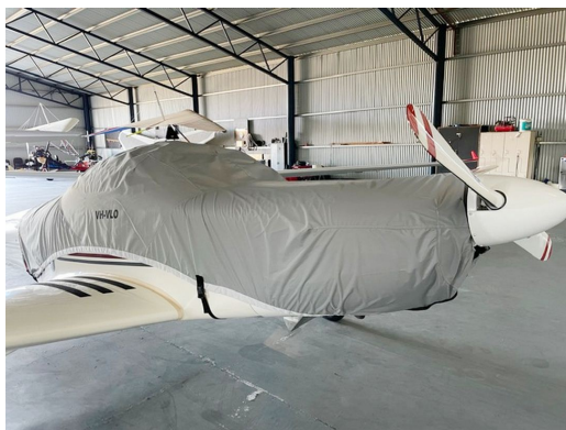
Ximango Travel Weight Canopy/Engine Cover