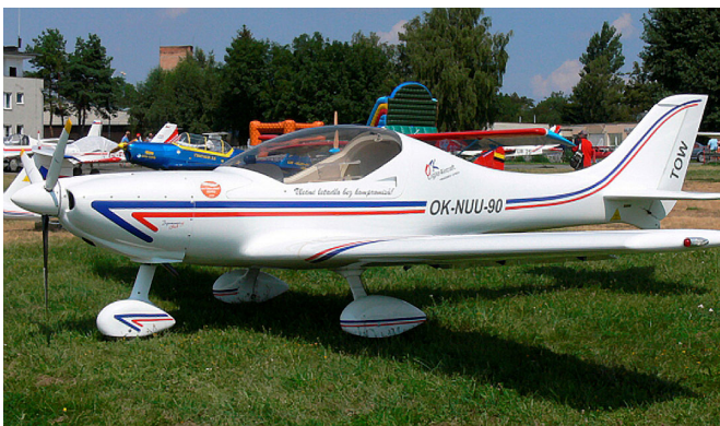
Covers, Plugs & HeatShields for Dynamic WT9

This cover type is made from Silver Acrylic Sunbrella canvas and is 100% lined with a soft and smooth microfiber. Bruce's Custom Covers developed this material combination especially for aircraft protection. The outer material is medium weight and treated for water resistance, UV resistance and anti-static buildup. The inner lining is a very soft and smooth microfiber to prevent scratching. The material is very reflective, and tests show that the cabin interior temperature can be reduced to near-ambient temperature on the hottest of days. It is water, ice and snow repellent, yet breathable to allow moisture to escape from between the cover and the aircraft surface.