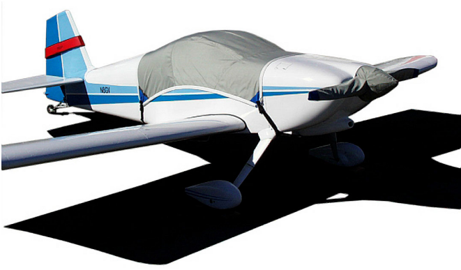
Canopy Cover, Prop Cover