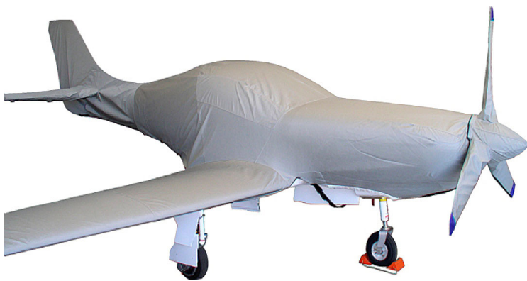
Lancair 320 Complete Fuselage/Wing Cover & Prop Cover

This cover type is made from Silver Acrylic Sunbrella canvas and is 100% lined with a soft and smooth microfiber. Bruce's Custom Covers developed this material combination especially for aircraft protection. The outer material is medium weight and treated for water resistance, UV resistance and anti-static buildup. The inner lining is a very soft and smooth microfiber to prevent scratching. The material is very reflective, and tests show that the cabin interior temperature can be reduced to near-ambient temperature on the hottest of days. It is water, ice and snow repellent, yet breathable to allow moisture to escape from between the cover and the aircraft surface.