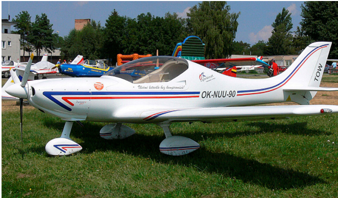
Covers, Plugs & HeatShields for Dynamic WT9

This cover type is made from Silver Acrylic Sunbrella canvas and is 100% lined with a soft and smooth microfiber. Bruce's Custom Covers developed this material combination especially for aircraft protection. The outer material is medium weight and treated for water resistance, UV resistance and anti-static buildup. The inner lining is a very soft and smooth microfiber to prevent scratching. The material is very reflective, and tests show that the cabin interior temperature can be reduced to near-ambient temperature on the hottest of days. It is water, ice and snow repellent, yet breathable to allow moisture to escape from between the cover and the aircraft surface.