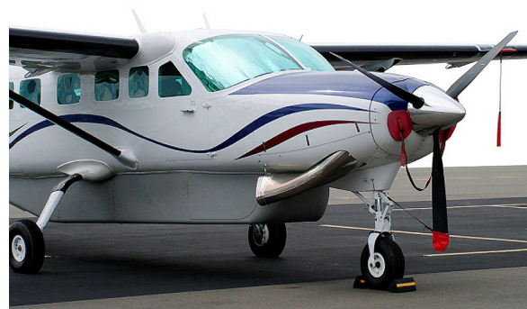
Cessna Caravan Windshield HeatShield, Plugs, Prop Ties & Pitot Cover