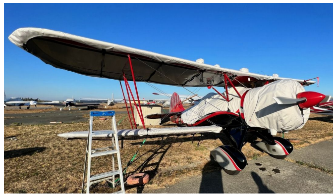
Waco YMF-5 Engine, Extended Canopy & Wing Covers