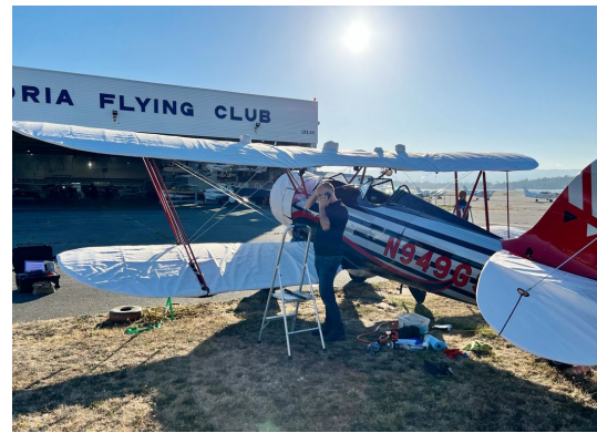
Waco YMF-5 Engine, Extended Canopy & Wing Covers Waco YMF-5 Engine, Extended Canopy, Wing Covers & Horizontal Stab Covers