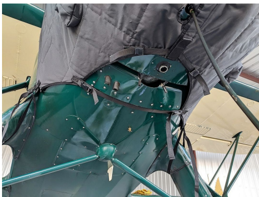
Wacon Cabin Biplane ZQC-6 Insulated Engine Cover

This cover type is made from Silver Acrylic Sunbrella canvas and is 100% lined with a soft and smooth microfiber. Bruce's Custom Covers developed this material combination especially for aircraft protection. The outer material is medium weight and treated for water resistance, UV resistance and anti-static buildup. The inner lining is a very soft and smooth microfiber to prevent scratching. The material is very reflective, and tests show that the cabin interior temperature can be reduced to near-ambient temperature on the hottest of days. It is water, ice and snow repellent, yet breathable to allow moisture to escape from between the cover and the aircraft surface.