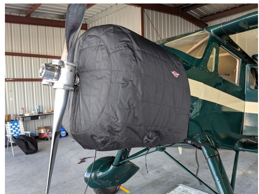
Wacon Cabin Biplane ZQC-6 Insulated Engine Cover