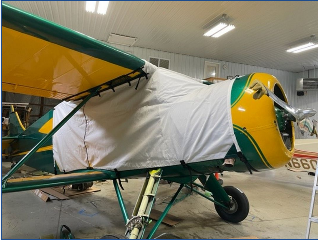
Waco Cabin Biplane Cabin Cover (Over Top Type), Ext. To Cover Baggage Door