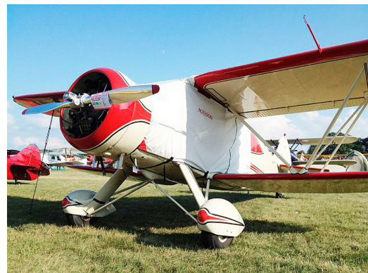
Waco AGC-8 Over-the-Top Canopy Cover