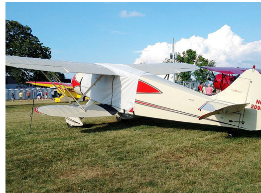
Waco AGC-8 Over-the-Top Canopy Cover