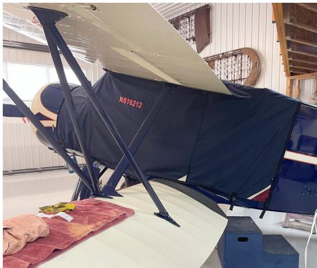
Waco YQC-6 Canopy Cover, over-top type