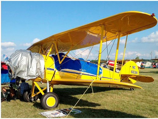
Waco 10 Canopy Cover