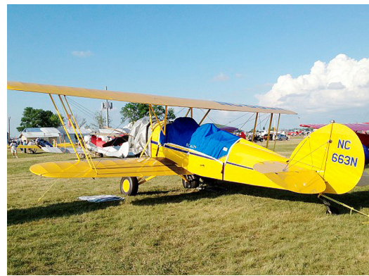
Waco 10 Canopy Cover