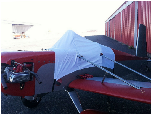
Volksplane Canopy Cover (test fit cover)

the hottest of days. It is water, ice and snow repellent, yet breathable to allow moisture to escape from between the cover and the aircraft surface.