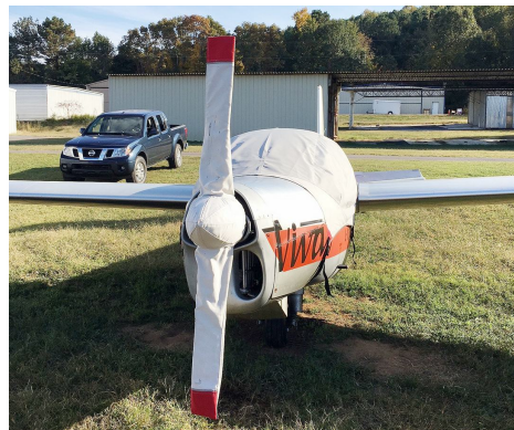
Aerotechnik L-13 Vivat Motorglider Prop/Spinner & Canopy Covers