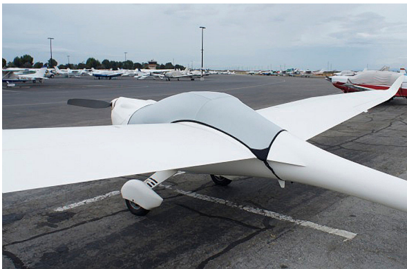
Lambada Canopy/Engine Cover and Wing Covers