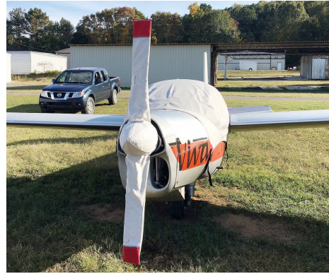
Aerotechnik L-13 Vivat Motorglider Prop/Spinner & Canopy Covers