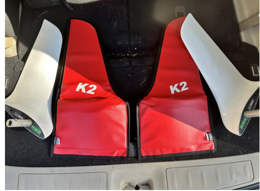
Discus CS Wingtip Pads (Set of 2)