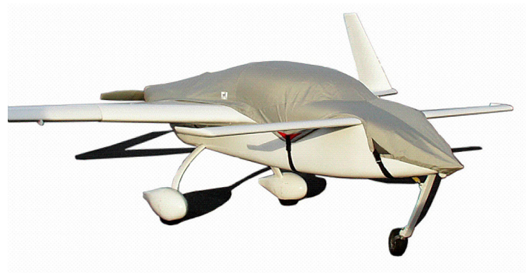
Cozy III Canopy/Nose/Engine Cover