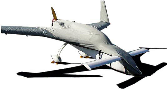
Long-EZ Canopy/Engine and Wing Covers