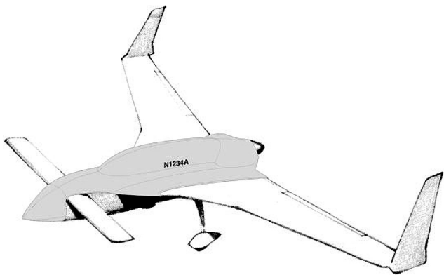
Rutan Long-EZ Canopy Cover