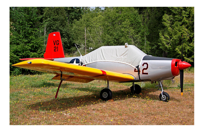
Varga Kachina Canopy Cover