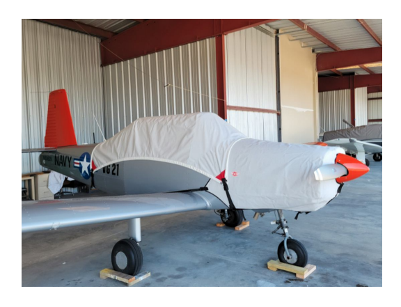
Varga Kachina Canopy & Engine Covers

This cover type is made from Silver Acrylic Sunbrella canvas and is 100% lined with a soft and smooth microfiber. Bruce's Custom Covers developed this material combination especially for aircraft protection. The outer material is medium weight and treated for water resistance, UV resistance and anti-static buildup. The inner lining is a very soft and smooth microfiber to prevent scratching. The material is very reflective, and tests show that the cabin interior temperature can be reduced to near-ambient temperature on the hottest of days. It is water, ice and snow repellent, yet breathable to allow moisture to escape from between the cover and the aircraft surface.