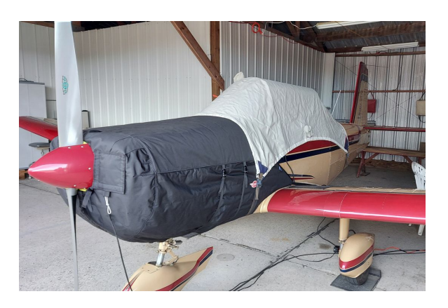
Varga 2150A Insulated Engine Cover, Canopy Cover