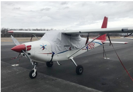
Vulcanair V1.0 canopy cover, Over Top style

Travel Covers are made with Silver Solution-Dyed Polyester fabric and only lined over the windshield to save weight. The material is lightweight and more compact for easy stowage in the aircraft. The polyester material is water resistant, but only intended for occasional use outside. We also have an ultra lightweight material available for fitted hangar dust covers. For daily outdoor use, the non-travel Sunbrella Cover is the best choice.