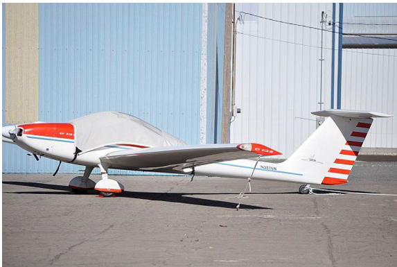
Grob 109 Canopy Cover