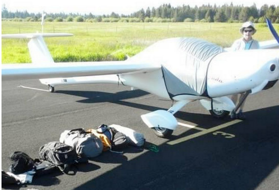
Distar Sundancer Travel Weight Canopy Cover