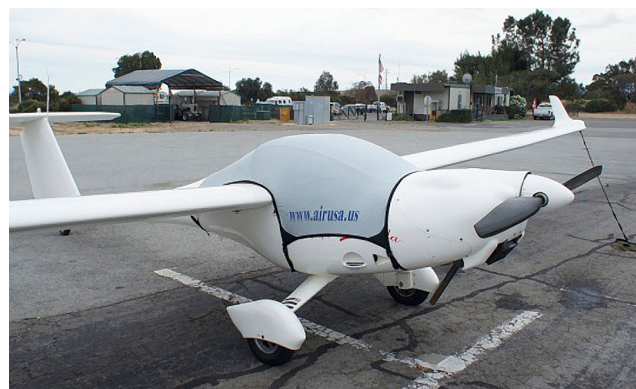
Lambada Travel Canopy Cover