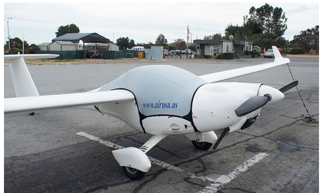
Lambda Travel Canopy Cover