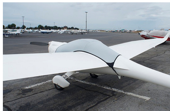
Lambada Canopy/Engine Cover and Wing Covers