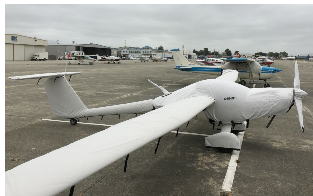
Lambada Canopy/Engine Cover and Wing Covers Distar Sundancer LSA Extended Canopy/Engine, Prop, Wheelpants, Wings & Empennage Covers