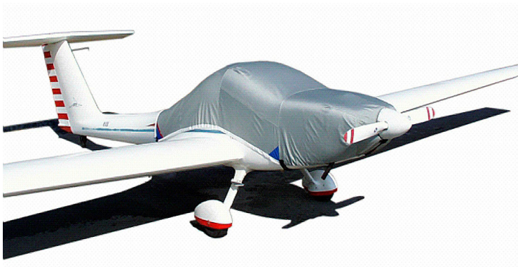
Grob 109 Canopy/Engine Cover