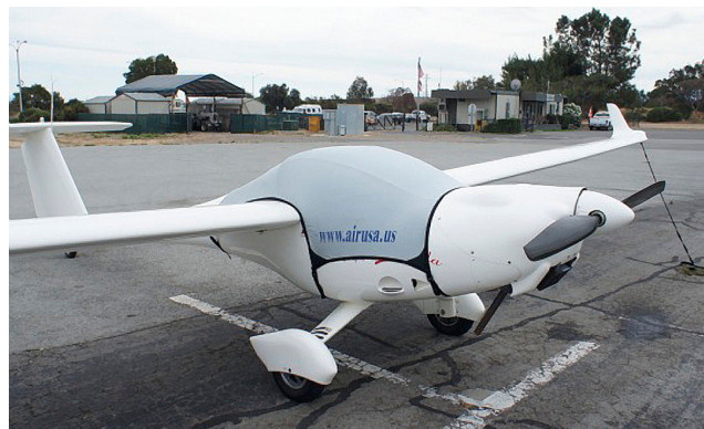
Lambda Travel Canopy Cover