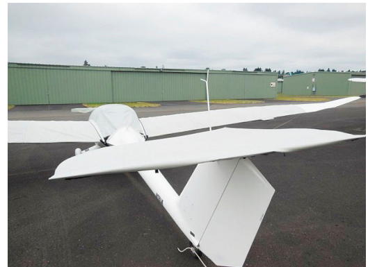
Lambada Canopy/Engine, Wing & Horiz. Stab. Covers