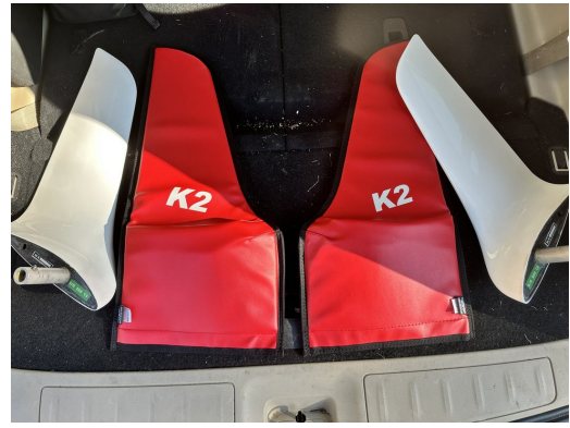
Discus CS Wingtip Pads (Set of 2)