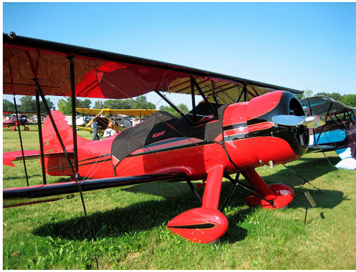
Waco UPF7 Canopy Cover