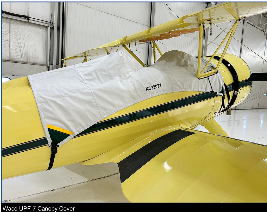
Waco UPF-7 Canopy Cover