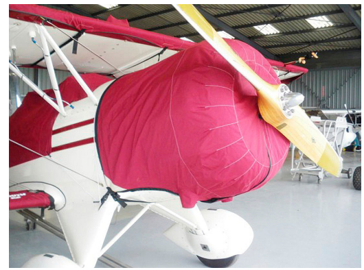
Waco UPF-7 Engine Cover