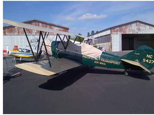
Travelair 4000 Canopy and Engine Cover