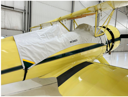
Waco UPF-7 Canopy Cover