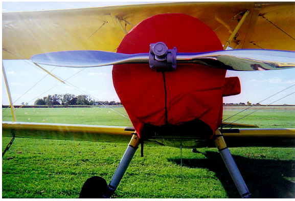
Stearman Engine Cover