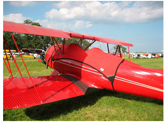
Waco UPF7 Canopy Cover