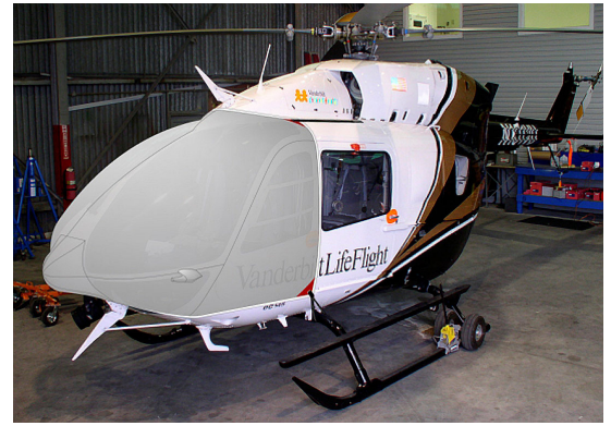
EC-145 Windshield/Nose Cover (illustration)