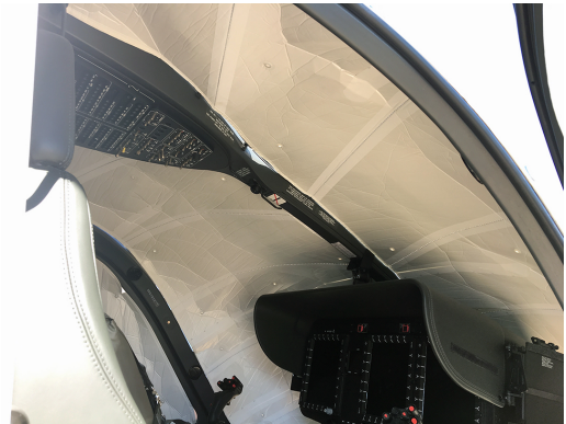
Eurocopter EC-145 Cockpit Heatshields