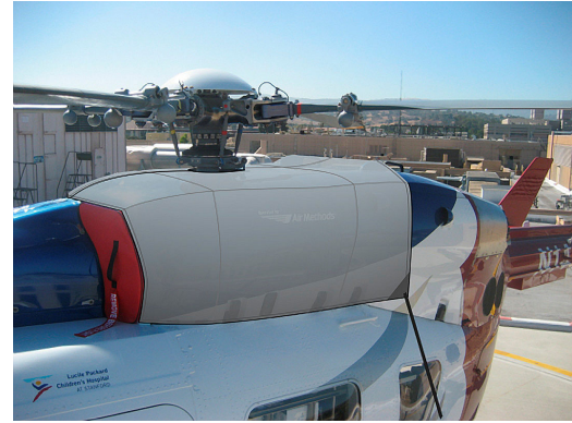
Bubble Cover w/ nose mounted radome, Upper Deck Plugs/Cover Upper Deck Plugs/Cover, extended to cover aft intake vents