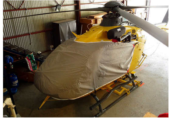
Eurocopter EC-135 Bubble Cover