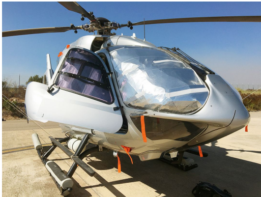
Eurocopter EC-145 Cockpit Heatshields

Cockpit Heatshields are interior sunshades for the aircraft's cockpit. The product is a unique composite of closed-cell foam with a silver mylar finish. The semi-rigid design is stiff enough to stand inside the window framing. Darts and folds are incorporated into the material so that it conforms to the complex shape of the helicopter windows. The set folds up flat and is easily stored in the included storage sleeve. Some designs may require velcro and suction cups. A Heatshield is an excellent short-term remedy for cockpit overheating, but an external fabric cover is more effective for long-term protection.