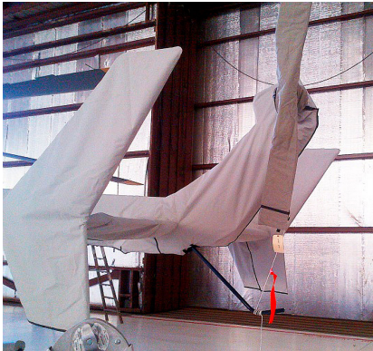
Tail Rotor Cover & Tailboom, Vertical Pylon & Stabilizers Cover

The Engine Inlet Plugs are custom fit for your Eurocopter UH-72 (EC-145) intakes, made with heavy-duty vinyl material, and stuffed with a single block of sculpted urethane foam. Each plug has a zipper that allows the foam to be removed and dried if necessary. Engine plugs have 'Remove Before Flight' streamers sewn onto the face of the plugs. Most plugs are imprinted with the aircraft registration number in black for an extra charge. Storage bag NOT included. Engine plugs may be inserted after flight when the engine is still warm. Engine Inlet Plugs are commonly referred to as Cowl Plugs, Intake Plugs, Cowl Blocks, Engine Blocks, and Engine Bungs.