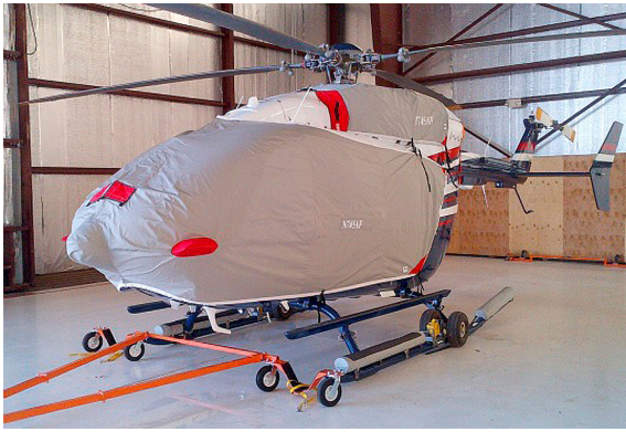
Bubble Cover w/ nose mounted radome & Upper Deck Plugs/Cover