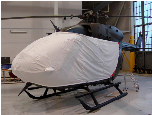
EC-145 Bubble Cover

Covers developed this material combination especially for aircraft protection. The outer material is medium weight and treated for water resistance, UV resistance and anti-static buildup. The inner lining is a very soft and smooth microfiber to prevent scratching. The material is very reflective, and tests show that the cabin interior temperature can be reduced to near-ambient temperature on the hottest of days. It is water, ice and snow repellent, yet breathable to allow moisture to escape from between the cover and the aircraft surface.