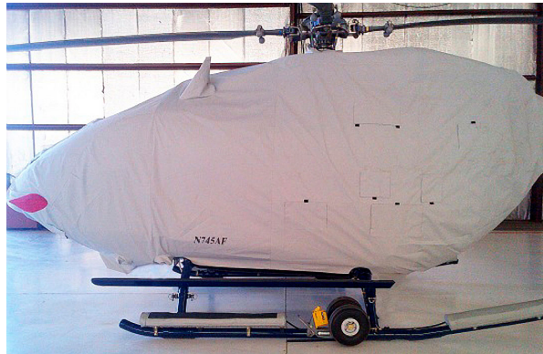
Eurocopter EC-145 Main Body Cover, also covers the bottom belly