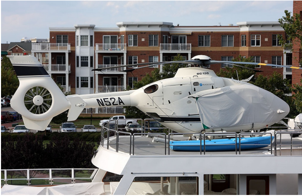
Eurocopter EC-135 Bubble Cover

Covers developed this material combination especially for aircraft protection. The outer material is medium weight and treated for water resistance, UV resistance and anti-static buildup. The inner lining is a very soft and smooth microfiber to prevent scratching. The material is very reflective, and tests show that the cabin interior temperature can be reduced to near-ambient temperature on the hottest of days. It is water, ice and snow repellent, yet breathable to allow moisture to escape from between the cover and the aircraft surface.