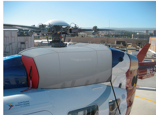
Bubble Cover w/ nose mounted radome, Upper Deck Plugs/Cover Upper Deck Plugs/Cover, extended to cover aft intake vents