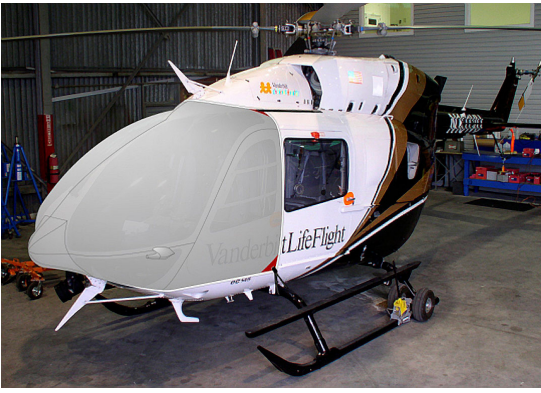
EC-145 Windshield/Nose Cover (illustration)