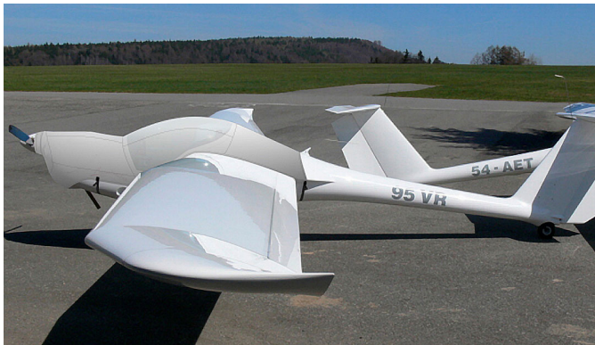
Lambda Canopy/Engine Cover (illustration)