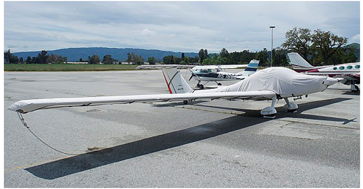
Grob 109 Canopy/Engine Cover & Horiz. Stabilizer Cover