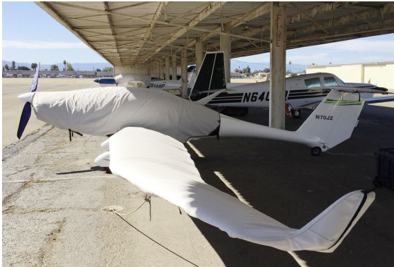
Phoenix Air U-15 Canopy/Engine, Wing & Horizontal Stabilizer Covers

WINTER USE MATERIAL - Made with Solution-Dyed Polyester fabric, this option is intended for seasonal use to aid in deicing, rain mitigation, or for occasional travel. The material is lighter and more compact, but more susceptible to UV damage and may have a shorter useful life if used continuously outside than the all-year use material.