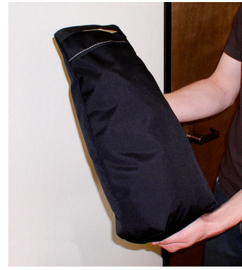
Light Weight Travel-Cover Mini-Storage Bag: 18" x 6" x 4"