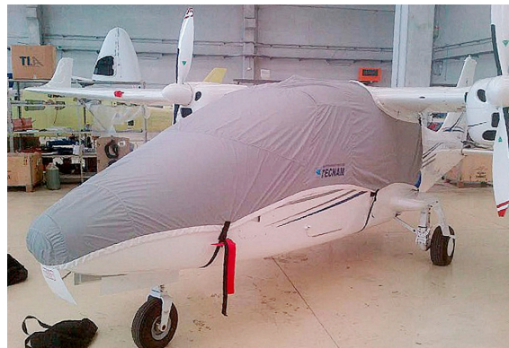
Tecnam P2006T Twin Lightweight Travel Canopy/Nose Cover

Travel Covers are made with Silver Solution-Dyed Polyester fabric and only lined over the windshield to save weight. The material is lightweight and more compact for easy stowage in the aircraft. The polyester material is water resistant, but only intended for occasional use outside. We also have an ultra lightweight material available for fitted hangar dust covers. For daily outdoor use, the non-travel Sunbrella Cover is the best choice.