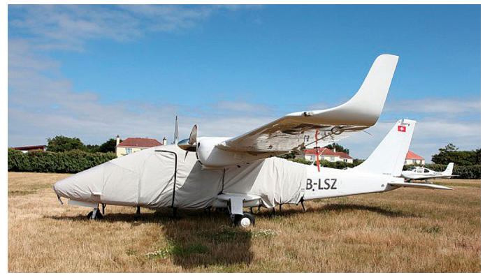
Tecnam Twin Extended Canopy/Nose Cover