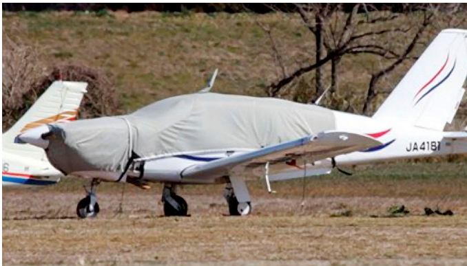
Canopy & Engine Covers

This cover type is made from Silver Acrylic Sunbrella canvas and is 100% lined with a soft and smooth microfiber. Bruce's Custom Covers developed this material combination especially for aircraft protection. The outer material is medium weight and treated for water resistance, UV resistance and anti-static buildup. The inner lining is a very soft and smooth microfiber to prevent scratching. The material is very reflective, and tests show that the cabin interior temperature can be reduced to near-ambient temperature on the hottest of days. It is water, ice and snow repellent, yet breathable to allow moisture to escape from between the cover and the aircraft surface.