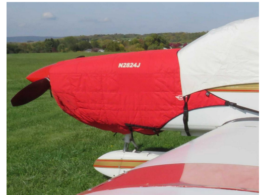
Socata TB-10 Insulated Engine Cover