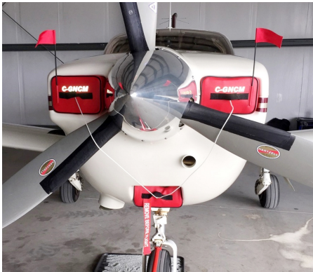
Socata TB-20 Engine Plugs, set of 3

Engine Inlet Plugs are custom fit for your Socata Tampico, Tobago & Trinidad intakes, made with heavy-duty vinyl material, and stuffed with a single block of sculpted urethane foam. Each plug has a zipper that allows the foam to be removed and dried if necessary. Engine plugs have warning flags that are visible from the cockpit or 'remove before flight' streamers sewn onto the face of the plugs. Most plugs are imprinted with the aircraft registration number in black for an extra charge. Storage bag NOT included. Engine plugs may be inserted after flight when the engine is still warm. Engine Inlet Plugs are commonly referred to as Cowl Plugs, Intake Plugs, Cowl Blocks, Engine Blocks, and Engine Bungs.