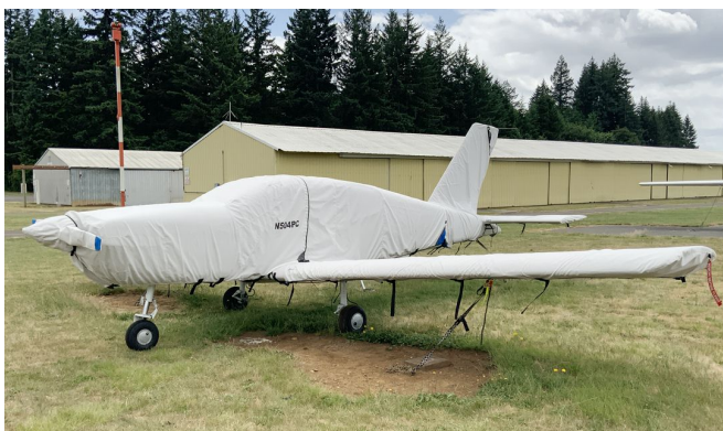
Socata Tampico TB-9C Cover Set

WINTER USE MATERIAL - Made with Solution-Dyed Polyester fabric, this option is intended for seasonal use to aid in deicing, rain mitigation, or for occasional travel. The material is lighter and more compact, but more susceptible to UV damage and may have a shorter useful life if used continuously outside than the all-year use material.