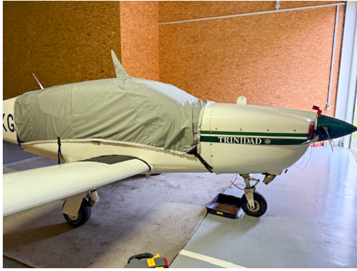
Trinidad TB20 Travel Cover, Light Weight Canopy Cover

Travel Covers are made with Silver Solution-Dyed Polyester fabric and only lined over the windshield to save weight. The material is lightweight and more compact for easy stowage in the aircraft. The polyester material is water resistant, but only intended for occasional use outside. We also have an ultra lightweight material available for fitted hangar dust covers. For daily outdoor use, the non-travel Sunbrella Cover is the best choice.