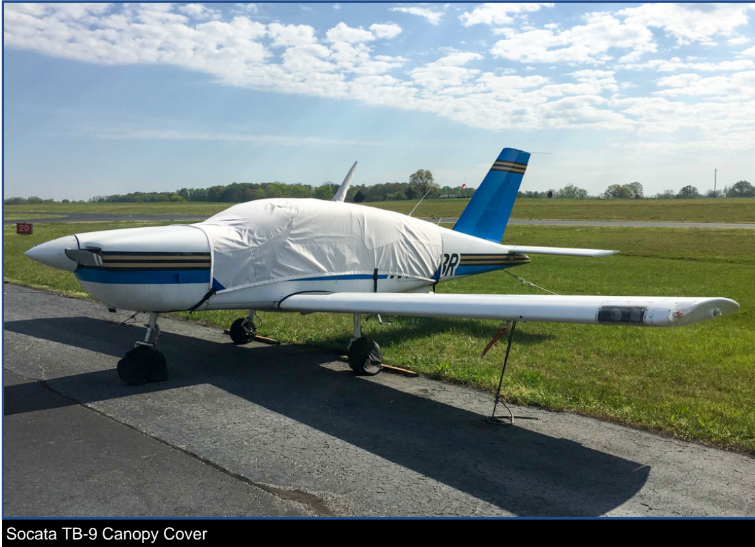
Socata TB-9 Canopy Cover