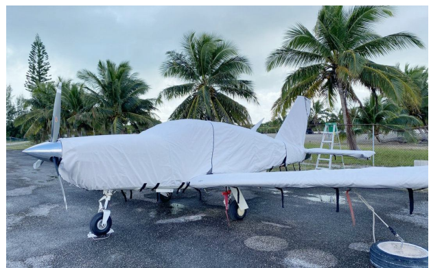
Socata Trinidad Full Cover Set