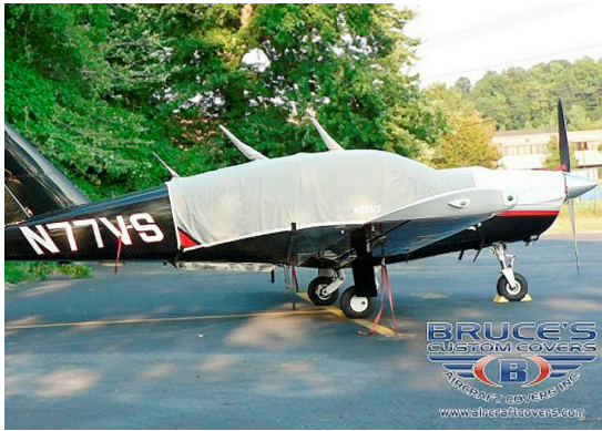
Socata TB20 Canopy Cover

This cover type is made from Silver Acrylic Sunbrella canvas and is 100% lined with a soft and smooth microfiber. Bruce's Custom Covers developed this material combination especially for aircraft protection. The outer material is medium weight and treated for water resistance, UV resistance and anti-static buildup. The inner lining is a very soft and smooth microfiber to prevent scratching. The material is very reflective, and tests show that the cabin interior temperature can be reduced to near-ambient temperature on the hottest of days. It is water, ice and snow repellent, yet breathable to allow moisture to escape from between the cover and the aircraft surface.