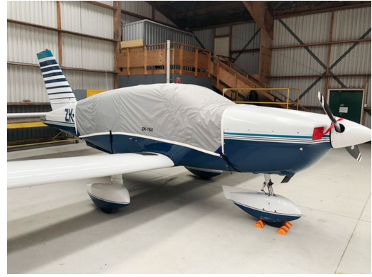
Socata TB-9 TRAVEL COVER, Light Weight Canopy Cover