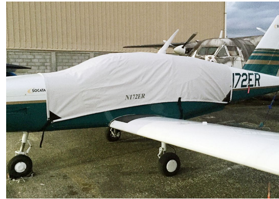
Socata TB 9 Tampico Canopy Cover