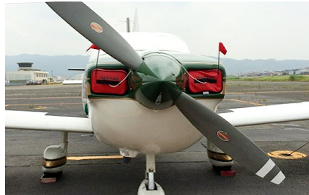
Socata TB-20 Engine Plugs