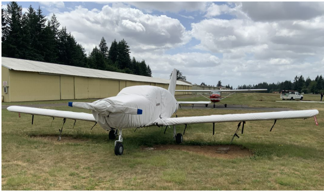
Socata Tampico TB-9C Cover Set

This cover type is made from Silver Acrylic Sunbrella canvas and is 100% lined with a soft and smooth microfiber. Bruce's Custom Covers developed this material combination especially for aircraft protection. The outer material is medium weight and treated for water resistance, UV resistance and anti-static buildup. The inner lining is a very soft and smooth microfiber to prevent scratching. The material is very reflective, and tests show that the cabin interior temperature can be reduced to near-ambient temperature on the hottest of days. It is water, ice and snow repellent, yet breathable to allow moisture to escape from between the cover and the aircraft surface.