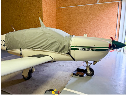
Trinidad TB20 Travel Cover, Light Weight Canopy Cover

Travel Covers are made with Silver Solution-Dyed Polyester fabric and only lined over the windshield to save weight. The material is lightweight and more compact for easy stowage in the aircraft. The polyester material is water resistant, but only intended for occasional use outside. We also have an ultra lightweight material available for fitted hangar dust covers. For daily outdoor use, the non-travel Sunbrella Cover is the best choice.