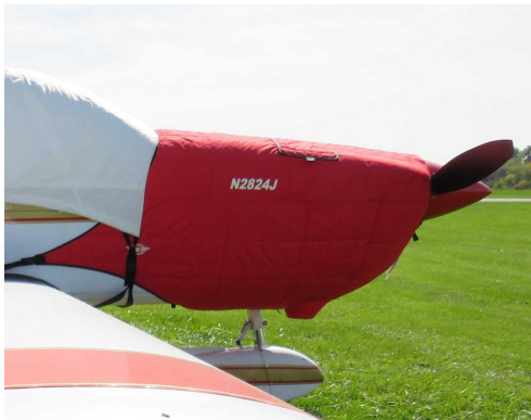
Socata TB-10 Insulated Engine Cover

This cover type is made from Silver Acrylic Sunbrella canvas and is 100% lined with a soft and smooth microfiber. Bruce's Custom Covers developed this material combination especially for aircraft protection. The outer material is medium weight and treated for water resistance, UV resistance and anti-static buildup. The inner lining is a very soft and smooth microfiber to prevent scratching. The material is very reflective, and tests show that the cabin interior temperature can be reduced to near-ambient temperature on the hottest of days. It is water, ice and snow repellent, yet breathable to allow moisture to escape from between the cover and the aircraft surface.