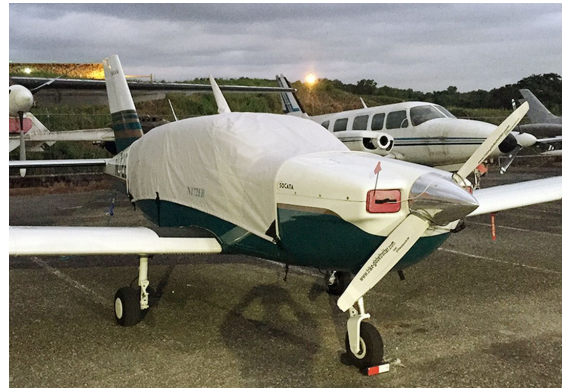
Socata TB9 Tampico Canopy Cover and Engine Inlet Plugs