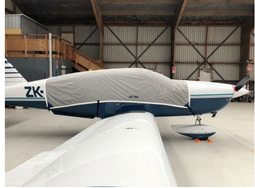
Socata TB-9 TRAVEL COVER, Light Weight Canopy Cover