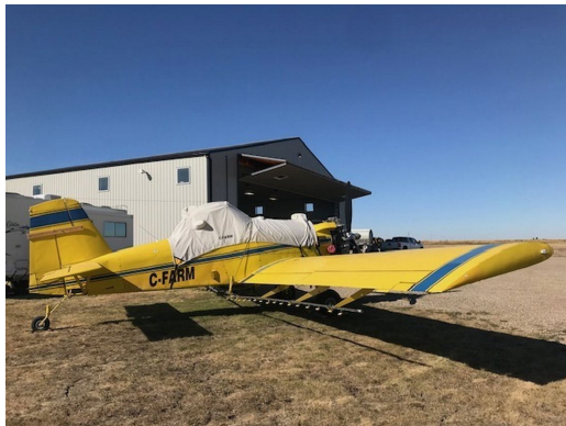
Air Tractor 401 Canopy/Hopper Cover

This cover type is made from Silver Acrylic Sunbrella canvas and is 100% lined with a soft and smooth microfiber. Bruce's Custom Covers developed this material combination especially for aircraft protection. The outer material is medium weight and treated for water resistance, UV resistance and anti-static buildup. The inner lining is a very soft and smooth microfiber to prevent scratching. The material is very reflective, and tests show that the cabin interior temperature can be reduced to near-ambient temperature on the hottest of days. It is water, ice and snow repellent, yet breathable to allow moisture to escape from between the cover and the aircraft surface.