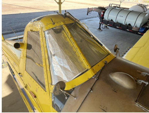
Air Tractor Cockpit HeatShields

foam with a silver mylar finish. The semi-rigid design is stiff enough to stand along the inside of the windshield using sun visors or window framing. It folds up flat and easily stores in the included storage sleeve. Some designs may require velcro and suction cups or split right and left sides. A Heatshield is an excellent short-term remedy for cockpit overheating. An external fabric cover is far more effective and practical for long-term protection.