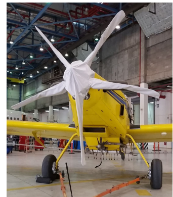
Air Tractor 5-Blade Prop Cover