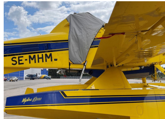
Air Tractor Light Weight Canopy Cover