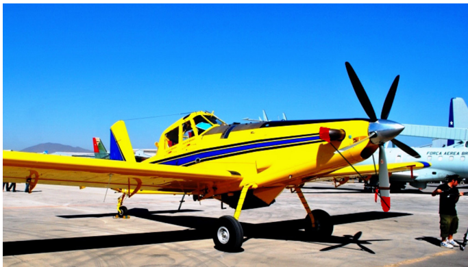
Air Tractor Prop Tie/Exhaust Covers

This cover type is made from Silver Acrylic Sunbrella canvas and is 100% lined with a soft and smooth microfiber. Bruce's Custom Covers developed this material combination especially for aircraft protection. The outer material is medium weight and treated for water resistance, UV resistance and anti-static buildup. The inner lining is a very soft and smooth microfiber to prevent scratching. The material is very reflective, and tests show that the cabin interior temperature can be reduced to near-ambient temperature on the hottest of days. It is water, ice and snow repellent, yet breathable to allow moisture to escape from between the cover and the aircraft surface.