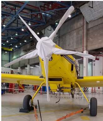
Air Tractor 5-Blade Prop Cover

This cover type is made from Silver Acrylic Sunbrella canvas and is 100% lined with a soft and smooth microfiber. Bruce's Custom Covers developed this material combination especially for aircraft protection. The outer material is medium weight and treated for water resistance, UV resistance and anti-static buildup. The inner lining is a very soft and smooth microfiber to prevent scratching. The material is very reflective, and tests show that the cabin interior temperature can be reduced to near-ambient temperature on the hottest of days. It is water, ice and snow repellent, yet breathable to allow moisture to escape from between the cover and the aircraft surface.