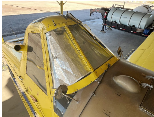
Air Tractor Cockpit HeatShields

foam with a silver mylar finish. The semi-rigid design is stiff enough to stand along the inside of the windshield using sun visors or window framing. It folds up flat and easily stores in the included storage sleeve. Some designs may require velcro and suction cups or split right and left sides. A Heatshield is an excellent short-term remedy for cockpit overheating. An external fabric cover is far more effective and practical for long-term protection.