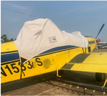
Air Tractor AT-402 Canopy/Hopper Cover

This cover type is made from Silver Acrylic Sunbrella canvas and is 100% lined with a soft and smooth microfiber. Bruce's Custom Covers developed this material combination especially for aircraft protection. The outer material is medium weight and treated for water resistance, UV resistance and anti-static buildup. The inner lining is a very soft and smooth microfiber to prevent scratching. The material is very reflective, and tests show that the cabin interior temperature can be reduced to near-ambient temperature on the hottest of days. It is water, ice and snow repellent, yet breathable to allow moisture to escape from between the cover and the aircraft surface.