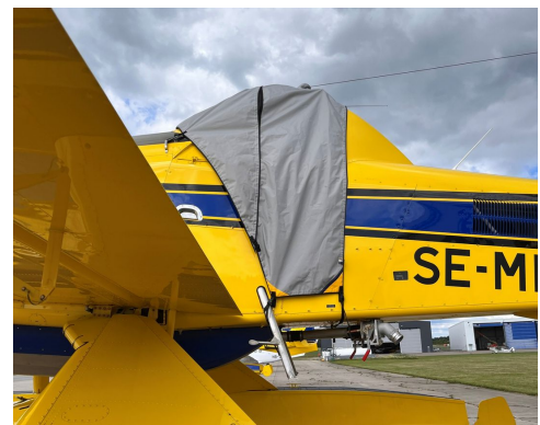
Air Tractor Light Weight Canopy Cover