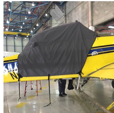
Air Tractor AT-802F Canopy Cover