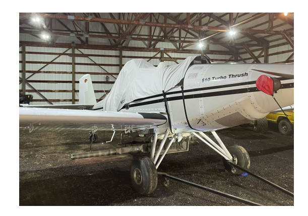
Thrush Aircraft S2R-T34 Canopy Cover, & Prop Tie/Exhaust Covers

This cover type is made from Silver Acrylic Sunbrella canvas and is 100% lined with a soft and smooth microfiber. Bruce's Custom Covers developed this material combination especially for aircraft protection. The outer material is medium weight and treated for water resistance, UV resistance and anti-static buildup. The inner lining is a very soft and smooth microfiber to prevent scratching. The material is very reflective, and tests show that the cabin interior temperature can be reduced to near-ambient temperature on the hottest of days. It is water, ice and snow repellent, yet breathable to allow moisture to escape from between the cover and the aircraft surface.