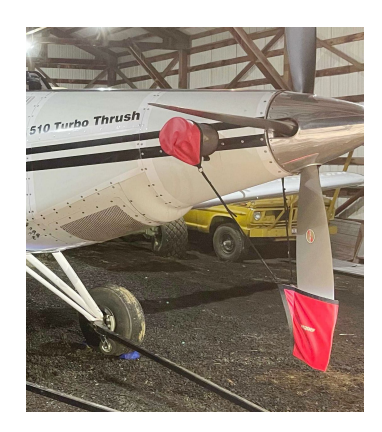
Ayres Thrush Prop Tie/Exhaust Covers

This cover type is made from Silver Acrylic Sunbrella canvas and is 100% lined with a soft and smooth microfiber. Bruce's Custom Covers developed this material combination especially for aircraft protection. The outer material is medium weight and treated for water resistance, UV resistance and anti-static buildup. The inner lining is a very soft and smooth microfiber to prevent scratching. The material is very reflective, and tests show that the cabin interior temperature can be reduced to near-ambient temperature on the hottest of days. It is water, ice and snow repellent, yet breathable to allow moisture to escape from between the cover and the aircraft surface.