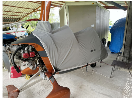
MTO Sport Travel Weight Canopy/Nose Cover