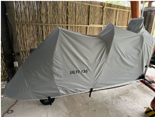
MTO Sport Travel Weight Canopy/Nose Cover

Travel Covers are made with Silver Solution-Dyed Polyester fabric and fully lined over the entire cover. The material is lightweight and more compact for easy stowage in the aircraft. The polyester material is water resistant, but only intended for occasional use outside. We also have an ultra lightweight material available for fitted hangar dust covers. For daily outdoor use, the non-travel Sunbrella Cover is the best choice.