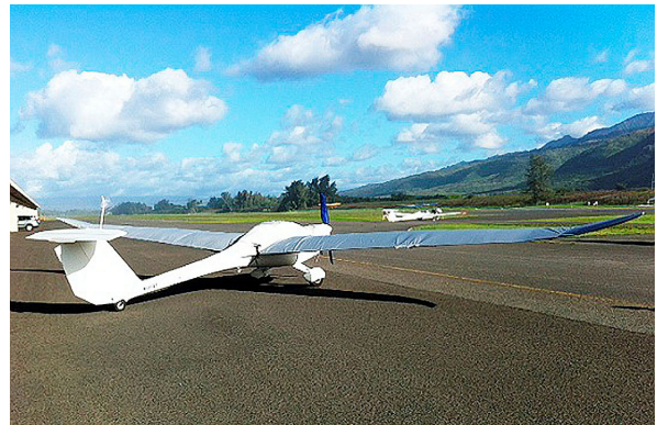
Lambda Canopy/Engine Cover and Wing Covers