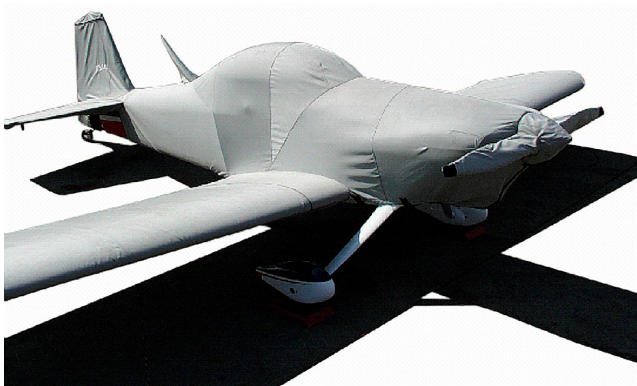
Van's RV-4 Complete Cover

This cover type is made from Silver Acrylic Sunbrella canvas and is 100% lined with a soft and smooth microfiber. Bruce's Custom Covers developed this material combination especially for aircraft protection. The outer material is medium weight and treated for water resistance, UV resistance and anti-static buildup. The inner lining is a very soft and smooth microfiber to prevent scratching. The material is very reflective, and tests show that the cabin interior temperature can be reduced to near-ambient temperature on the hottest of days. It is water, ice and snow repellent, yet breathable to allow moisture to escape from between the cover and the aircraft surface.