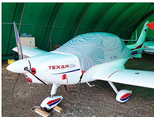
Texan Club Sport 550 Lightweight Travel Cover and Engine Inlet Plugs set