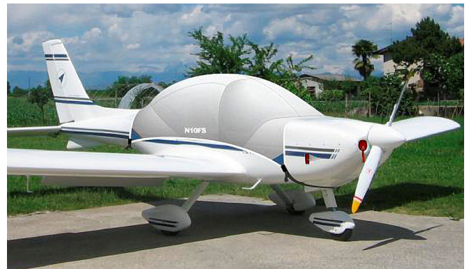
Texan Canopy Cover & Engine Plugs (Illustration)