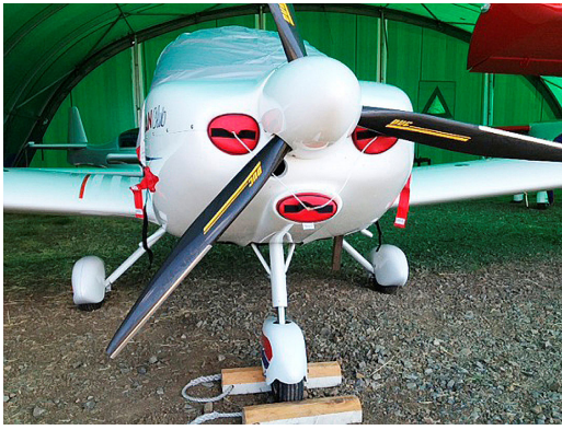
Texan Club Sport 550 Lightweight Travel Cover and Engine Inlet Plugs set