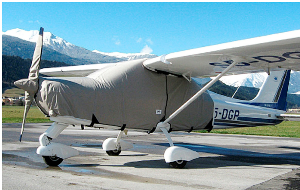
Tecnam Echo Extended Canopy, Engine, Prop Covers