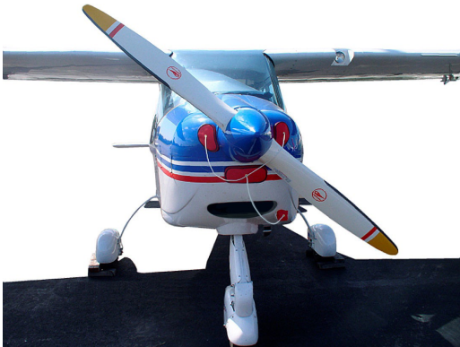
Tecnam Bravo Engine Plugs

Engine Inlet Plugs are custom fit for your Tecnam P92 Eaglet intakes, made with heavy-duty vinyl material, and stuffed with a single block of sculpted urethane foam. Each plug has a zipper that allows the foam to be removed and dried if necessary. Engine plugs have warning flags that are visible from the cockpit or 'remove before flight' streamers sewn onto the face of the plugs. Most plugs are imprinted with the aircraft registration number in black for an extra charge. Storage bag NOT included. Engine plugs may be inserted after flight when the engine is still warm. Engine Inlet Plugs are commonly referred to as Cowl Plugs, Intake Plugs, Cowl Blocks, Engine Blocks, and Engine Bungs.