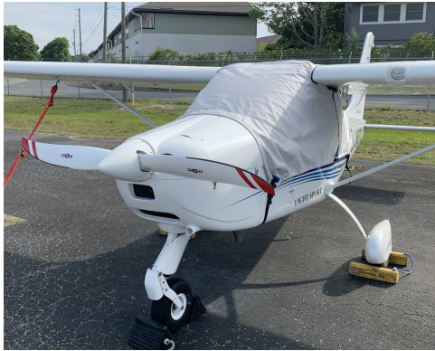
Tecnam P92 EAGLET Canopy Cover Over theTop Style

The material is very reflective, and tests show that the cabin interior temperature can be reduced to near-ambient temperature on the hottest of days. It is water, ice and snow repellent, yet breathable to allow moisture to escape from between the cover and the aircraft surface.