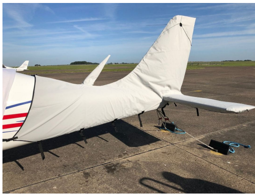
Tecnam P2008 Empennage Cover (Tailboom, Vertical & Horiz Stabilizers), All Year Use