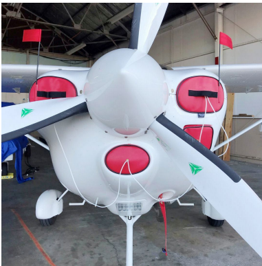
Tecnam Engine Plugs, set of 5