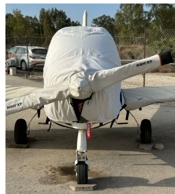
Tecnam Sierra Complete Cover Set