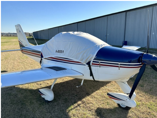
Tecnam P2002 Sierra Canopy Cover