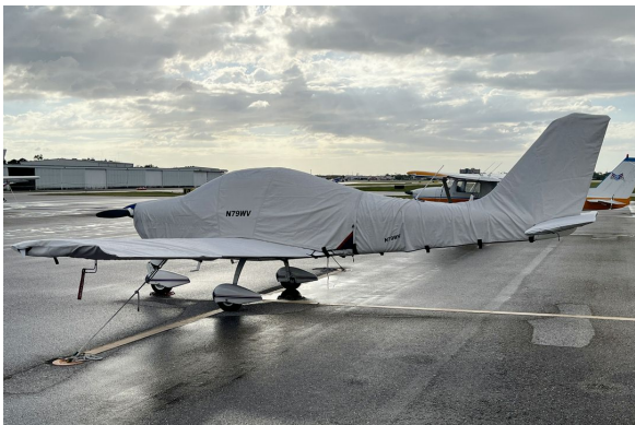
Tecnam P2002 Sierra Complete Cover Set

WINTER USE MATERIAL - Made with Solution-Dyed Polyester fabric, this option is intended for seasonal use to aid in deicing, rain mitigation, or for occasional travel. The material is lighter and more compact, but more susceptible to UV damage and may have a shorter useful life if used continuously outside than the all-year use material.