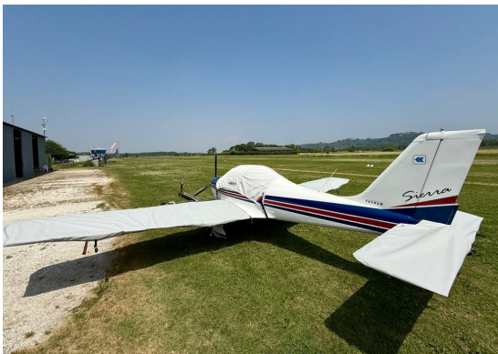
Tecnam P2002 Sierra Canopy, Wing & Horizontal Stabilizer Covers