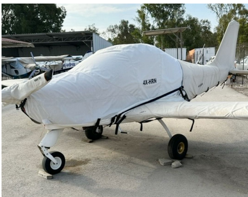
Tecnam Sierra Complete Cover Set

This cover type is made from Silver Acrylic Sunbrella canvas and is 100% lined with a soft and smooth microfiber. Bruce's Custom Covers developed this material combination especially for aircraft protection. The outer material is medium weight and treated for water resistance, UV resistance and anti-static buildup. The inner lining is a very soft and smooth microfiber to prevent scratching. The material is very reflective, and tests show that the cabin interior temperature can be reduced to near-ambient temperature on the hottest of days. It is water, ice and snow repellent, yet breathable to allow moisture to escape from between the cover and the aircraft surface.