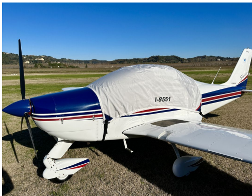
Tecnam P2002 Sierra Canopy Cover

This cover type is made from Silver Acrylic Sunbrella canvas and is 100% lined with a soft and smooth microfiber. Bruce's Custom Covers developed this material combination especially for aircraft protection. The outer material is medium weight and treated for water resistance, UV resistance and anti-static buildup. The inner lining is a very soft and smooth microfiber to prevent scratching. The material is very reflective, and tests show that the cabin interior temperature can be reduced to near-ambient temperature on the hottest of days. It is water, ice and snow repellent, yet breathable to allow moisture to escape from between the cover and the aircraft surface.