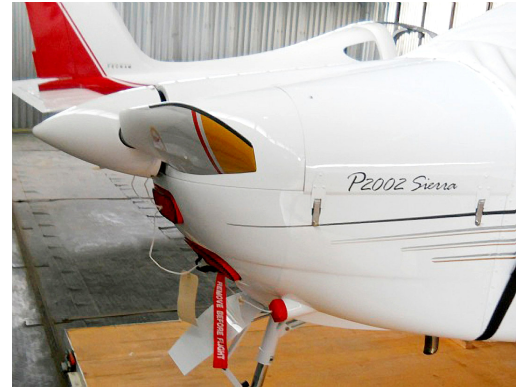
Tecnam Sierra Engine Inlet Plugs set