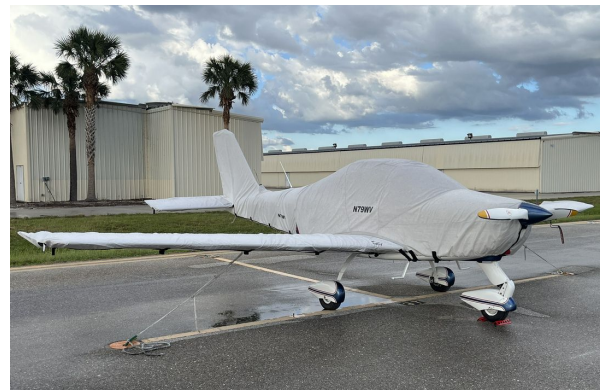
Tecnam P2002 Sierra Complete Cover Set