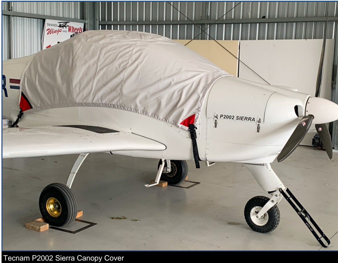
Tecnam P2002 Sierra Canopy Cover