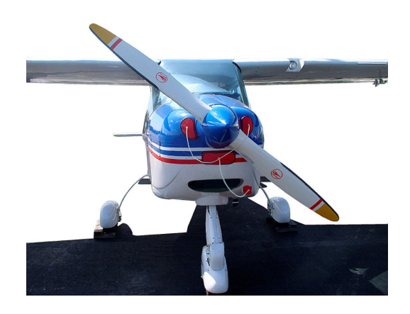
Tecnam Bravo Engine Plugs