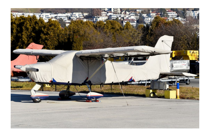
Tecnam P92 Echo Complete Cover Set