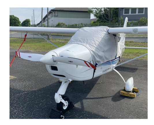
Tecnam P92 EAGLET Canopy Cover Over the Top Style