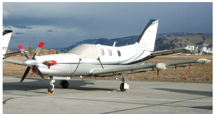
Socata TBM Cockpit, Wings, Horizontal Stab. Covers