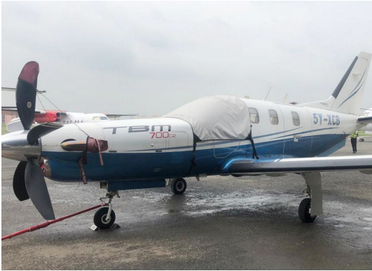
Socata TBM 700 Cockpit Cover, (Forward Belly Strap, Aft Snap Strap)