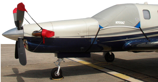
TBM700 Cockpit Cover, Engine Plugs, Prop Tie/Exhaust Covers

Travel Covers are made with Silver Solution-Dyed Polyester fabric and only lined over the windshield to save weight. The material is lightweight and more compact for easy stowage in the aircraft. The polyester material is water resistant, but only intended for occasional use outside. We also have an ultra lightweight material available for fitted hangar dust covers. For daily outdoor use, the non-travel Sunbrella Cover is the best choice.