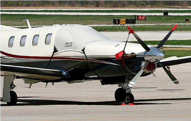
TBM-900 Static Wick Protector