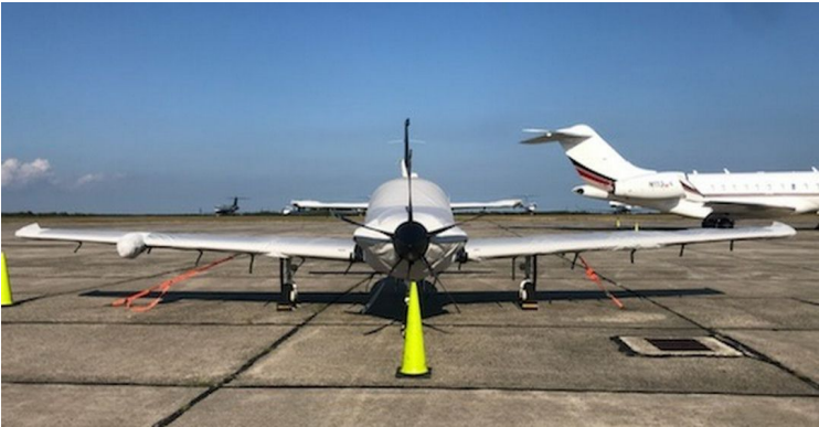
Socata TBM Canopy, Engine, Wing & Horizontal Stabilizer Covers