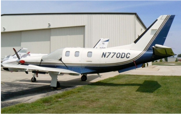
Socata TBM 700 Cockpit Cover, Prop Tie/Exhaust Cover Set

This cover type is made from Silver Acrylic Sunbrella canvas and is 100% lined with a soft and smooth microfiber. Bruce's Custom Covers developed this material combination especially for aircraft protection. The outer material is medium weight and treated for water resistance, UV resistance and anti-static buildup. The inner lining is a very soft and smooth microfiber to prevent scratching. The material is very reflective, and tests show that the cabin interior temperature can be reduced to near-ambient temperature on the hottest of days. It is water, ice and snow repellent, yet breathable to allow moisture to escape from between the cover and the aircraft surface.