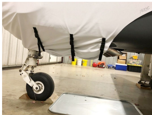
Socata TB-20/21 Extended Canopy Cover and Insulated Engine Cover Socata Epsilon TB-30 Insulated Engine Cover, test fit cover