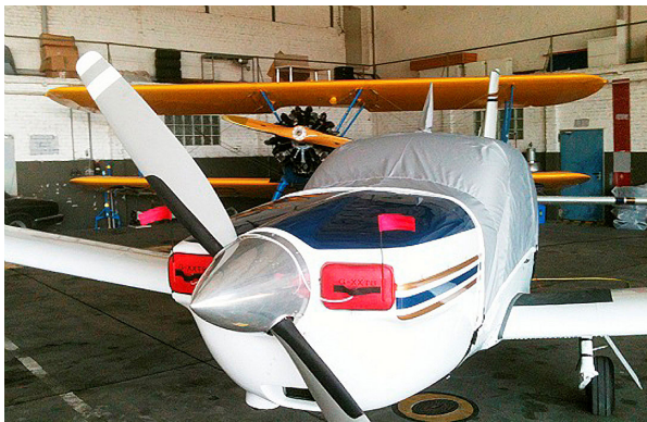
Socata TB20 Canopy Cover and Engine Inlet Plugs