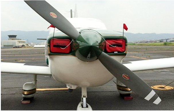
Socata TB-20 Engine Plugs