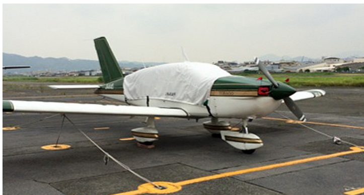
Socata TB-20 Canopy Cover

Travel Covers are made with Silver Solution-Dyed Polyester fabric and only lined over the windshield to save weight. The material is lightweight and more compact for easy stowage in the aircraft. The polyester material is water resistant, but only intended for occasional use outside. We also have an ultra lightweight material available for fitted hangar dust covers. For daily outdoor use, the non-travel Sunbrella Cover is the best choice.