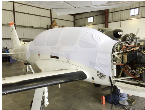
Socata TB30 Epsilon Canopy Cover, test fit cover