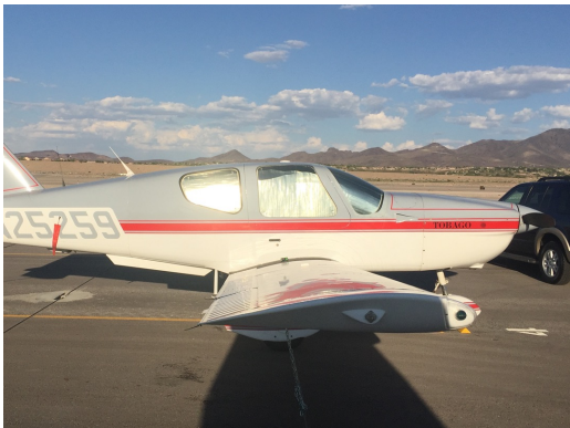
Socata TB-10 Cabin HeatShields

Windshield Heatshields are interior sunshades for an aircraft's front windshield. The product is a unique composite of closed-cell foam with a silver mylar finish. The semi-rigid design is stiff enough to stand along the inside of the windshield using sun visors or window framing. It folds up flat and easily stores in the included storage sleeve. Some designs may require velcro and suction cups or split right and left sides. A Heatshield is an excellent short-term remedy for cockpit overheating. An external fabric cover is far more effective and practical for long-term protection.