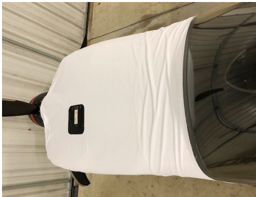
Socata Epsilon TB-30 Insulated Engine Cover, test fit cover

This cover type is made from Silver Acrylic Sunbrella canvas and is 100% lined with a soft and smooth microfiber. Bruce's Custom Covers developed this material combination especially for aircraft protection. The outer material is medium weight and treated for water resistance, UV resistance and anti-static buildup. The inner lining is a very soft and smooth microfiber to prevent scratching. The material is very reflective, and tests show that the cabin interior temperature can be reduced to near-ambient temperature on the hottest of days. It is water, ice and snow repellent, yet breathable to allow moisture to escape from between the cover and the aircraft surface.