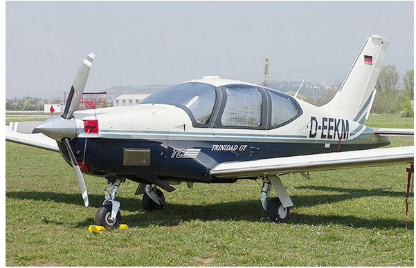
TB-9 Engine Plugs and HeatShields