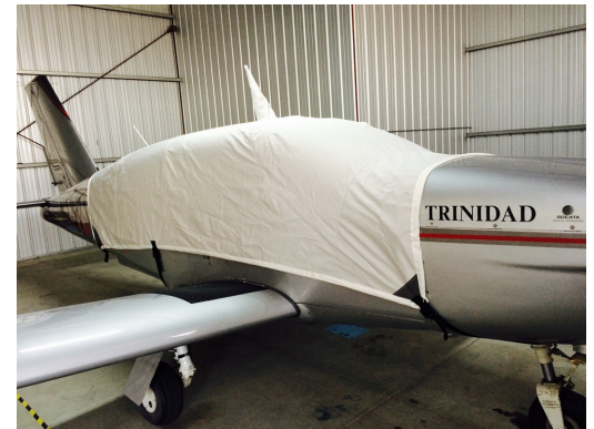
Trinidad Canopy Cover