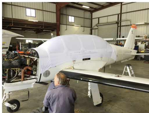
Socata TB30 Epsilon Canopy Cover, test fit cover