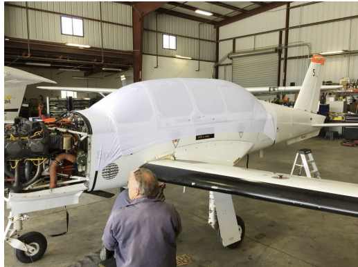
Socata TB30 Epsilon Canopy Cover, test fit cover