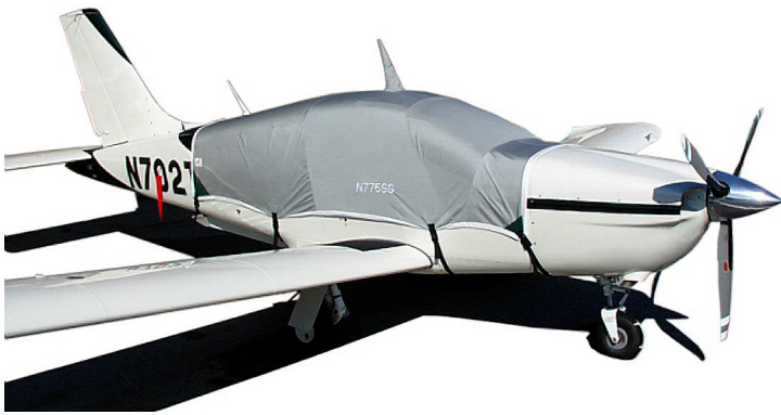
TB20 Standard Canopy Cover