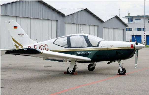
Socata Tobago TB20 Heatshields

Windshield Heatshields are interior sunshades for an aircraft's front windshield. The product is a unique composite of closed-cell foam with a silver mylar finish. The semi-rigid design is stiff enough to stand along the inside of the windshield using sun visors or window framing. It folds up flat and easily stores in the included storage sleeve. Some designs may require velcro and suction cups or split right and left sides. A Heatshield is an excellent short-term remedy for cockpit overheating. An external fabric cover is far more effective and practical for long-term protection.