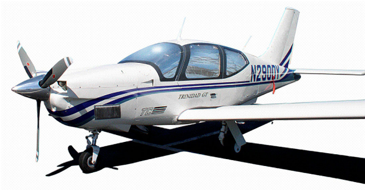
Socata TB20 HeatShields