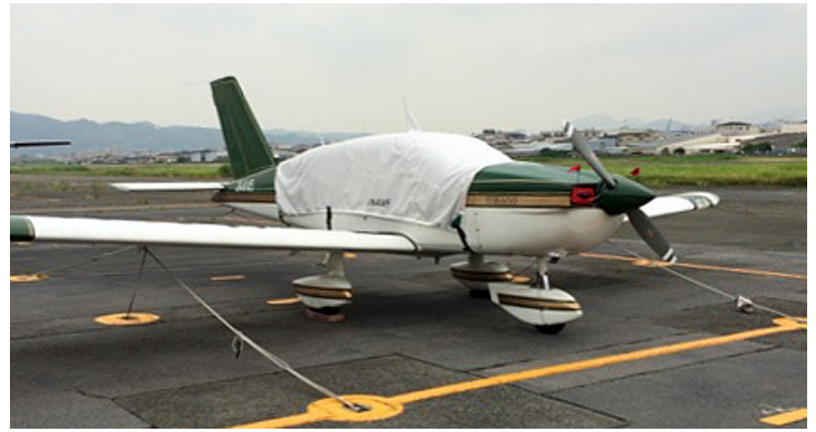
Socata TB-20 Canopy Cover