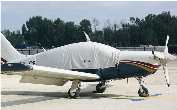
SOCATA TB-20 Canopy & Prop Covers