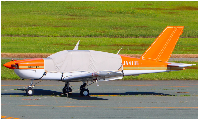
Socata TB-9 Tampico Canopy Cover