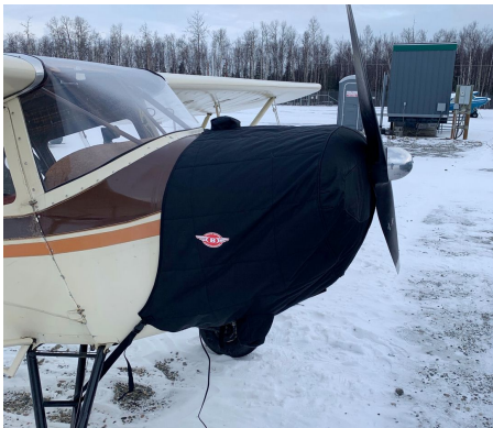
Taylorcraft Insulated Engine Cover

This cover type is made from Silver Acrylic Sunbrella canvas and is 100% lined with a soft and smooth microfiber. Bruce's Custom Covers developed this material combination especially for aircraft protection. The outer material is medium weight and treated for water resistance, UV resistance and anti-static buildup. The inner lining is a very soft and smooth microfiber to prevent scratching. The material is very reflective, and tests show that the cabin interior temperature can be reduced to near-ambient temperature on the hottest of days. It is water, ice and snow repellent, yet breathable to allow moisture to escape from between the cover and the aircraft surface.