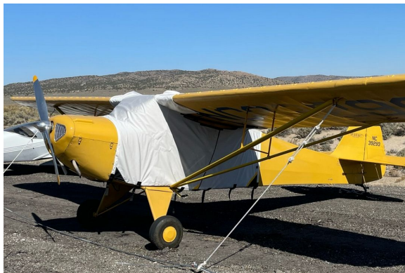
Taylorcraft BC-12D Extended Canopy Cover

This cover type is made from Silver Acrylic Sunbrella canvas and is 100% lined with a soft and smooth microfiber. Bruce's Custom Covers developed this material combination especially for aircraft protection. The outer material is medium weight and treated for water resistance, UV resistance and anti-static buildup. The inner lining is a very soft and smooth microfiber to prevent scratching. The material is very reflective, and tests show that the cabin interior temperature can be reduced to near-ambient temperature on the hottest of days. It is water, ice and snow repellent, yet breathable to allow moisture to escape from between the cover and the aircraft surface.