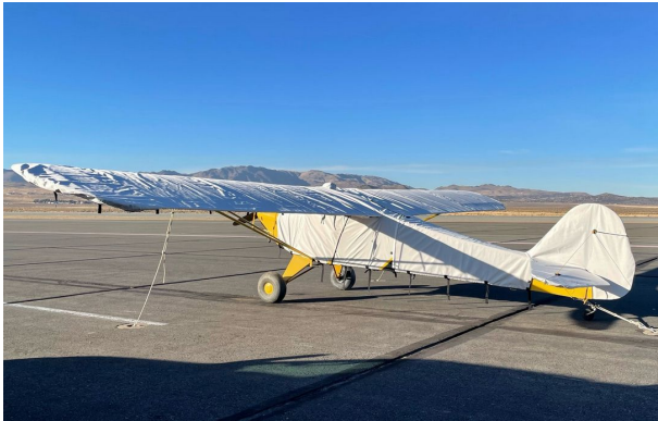
Taylorcraft BC-12D Extended Canopy, Wing & Empennage Covers