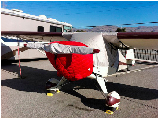
Taylorcraft Insulated Engine Cover, Prop and Canopy Covers