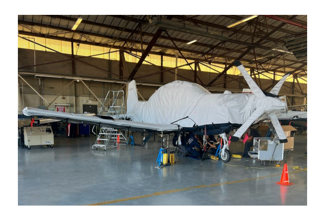
Beech T-6A Texan 2 Complete Hail Protection Cover Set