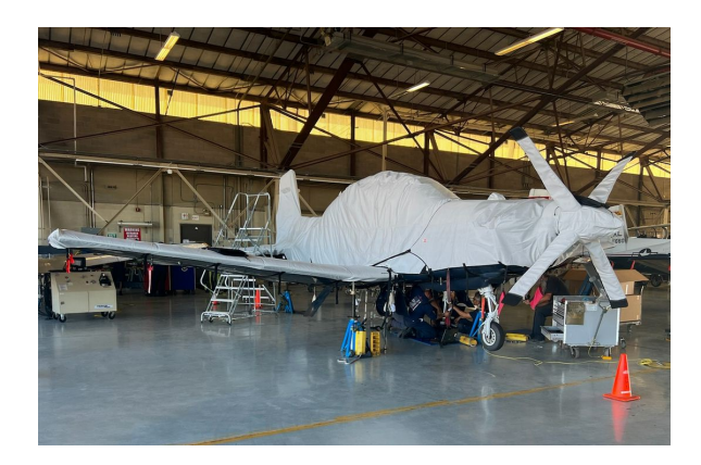
Beech T-6A Texan 2 Complete Hail Protection Cover Set

WINTER USE MATERIAL - Made with Solution-Dyed Polyester fabric, this option is intended for seasonal use to aid in deicing, rain mitigation, or for occasional travel. The material is lighter and more compact, but more susceptible to UV damage and may have a shorter useful life if used continuously outside than the all-year use material.