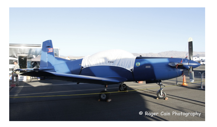
Pilatus PC-7 Canopy Cover