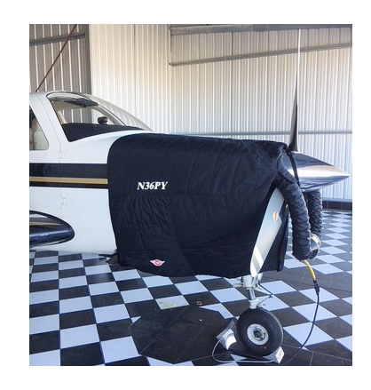
Beech Bonanza 36 Models Insulated Engine Cover

This cover type is made from Silver Acrylic Sunbrella canvas and is 100% lined with a soft and smooth microfiber. Bruce's Custom Covers developed this material combination especially for aircraft protection. The outer material is medium weight and treated for water resistance, UV resistance and anti-static buildup. The inner lining is a very soft and smooth microfiber to prevent scratching. The material is very reflective, and tests show that the cabin interior temperature can be reduced to near-ambient temperature on the hottest of days. It is water, ice and snow repellent, yet breathable to allow moisture to escape from between the cover and the aircraft surface.