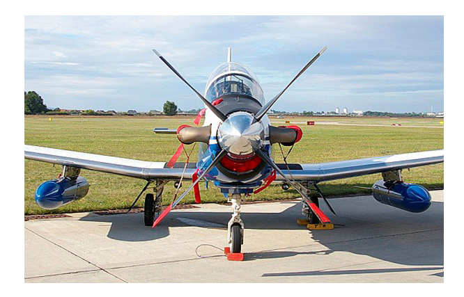
Texan II T6A Engine Inlet Plug, Prop Tie/Exhaust Covers

Engine plugs may be inserted after flight when the engine is still warm. Engine Inlet Plugs are commonly referred to as Cowl Plugs, Intake Plugs, Cowl Blocks, Engine Blocks, and Engine Bungs.