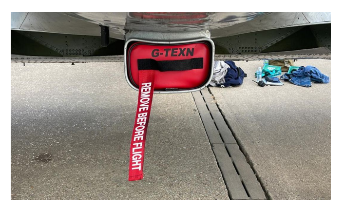
T6 Harvard Chin Scoop Plug

Engine Inlet Plugs are custom fit for your North American T6, SNJ, Harvard intakes, made with heavy-duty vinyl material, and stuffed with a single block of sculpted urethane foam. Each plug has a zipper that allows the foam to be removed and dried if necessary. Engine plugs have warning flags that are visible from the cockpit or 'remove before flight' streamers sewn onto the face of the plugs. Most plugs are imprinted with the aircraft registration number in black for an extra charge. Storage bag NOT included. Engine plugs may be inserted after flight when the engine is still warm. Engine Inlet Plugs are commonly referred to as Cowl Plugs, Intake Plugs, Cowl Blocks, Engine Blocks, and Engine Bungs.