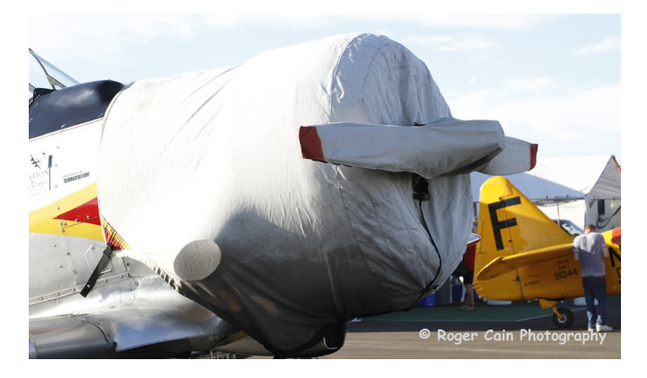
North American T6 Engine & Prop Cover

Travel Covers are made with Silver Solution-Dyed Polyester fabric and only lined over the windshield to save weight. The material is lightweight and more compact for easy stowage in the aircraft. The polyester material is water resistant, but only intended for occasional use outside. We also have an ultra lightweight material available for fitted hangar dust covers. For daily outdoor use, the non-travel Sunbrella Cover is the best choice.