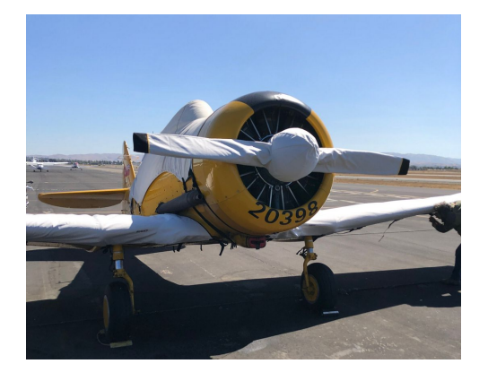
North American Harvard T6 Canopy, Prop & Wing Covers

WINTER USE MATERIAL - Made with Solution-Dyed Polyester fabric, this option is intended for seasonal use to aid in deicing, rain mitigation, or for occasional travel. The material is lighter and more compact, but more susceptible to UV damage and may have a shorter useful life if used continuously outside than the all-year use material.