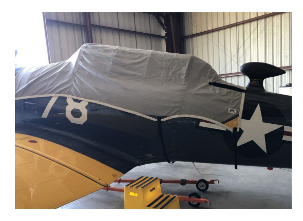
North American T6 Canopy Cover w/30" fwd bib