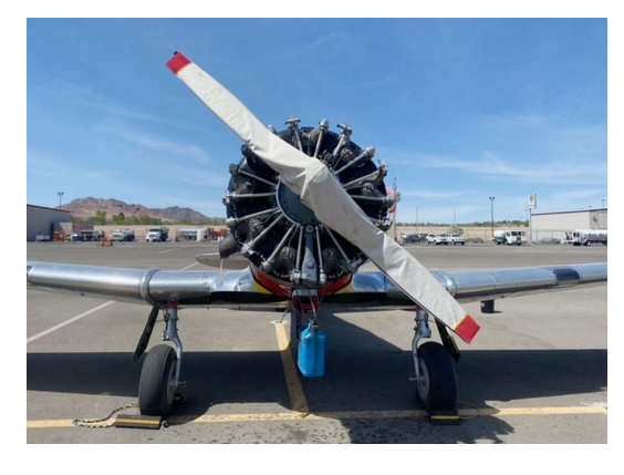
North American T6 Prop Cover