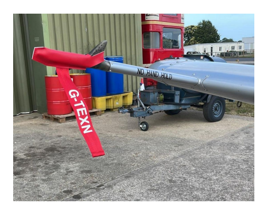
T6 Harvard Pitot Cover, shark fin type