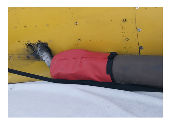
North American T6 Exhaust Cover, cold weather type

This cover type is made from Silver Acrylic Sunbrella canvas and is 100% lined with a soft and smooth microfiber. Bruce's Custom Covers developed this material combination especially for aircraft protection. The outer material is medium weight and treated for water resistance, UV resistance and anti-static buildup. The inner lining is a very soft and smooth microfiber to prevent scratching. The material is very reflective, and tests show that the cabin interior temperature can be reduced to near-ambient temperature on the hottest of days. It is water, ice and snow repellent, yet breathable to allow moisture to escape from between the cover and the aircraft surface.