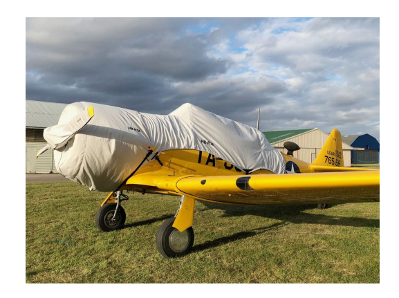
North American T6 Canopy Cover with 30" fwd ext (multi piece back glass), Engine & Prop Covers