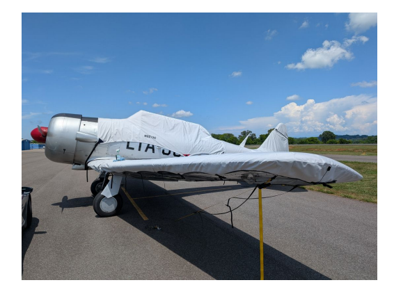
North American T6 Canopy Cover w/30" Extension, Wing Covers