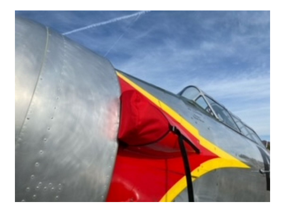
North American T6 Carb Air Scoop Cover