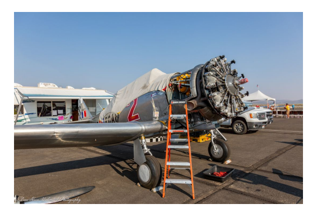
North American T6 Canopy Cover

This cover type is made from Silver Acrylic Sunbrella canvas and is 100% lined with a soft and smooth microfiber. Bruce's Custom Covers developed this material combination especially for aircraft protection. The outer material is medium weight and treated for water resistance, UV resistance and anti-static buildup. The inner lining is a very soft and smooth microfiber to prevent scratching. The material is very reflective, and tests show that the cabin interior temperature can be reduced to near-ambient temperature on the hottest of days. It is water, ice and snow repellent, yet breathable to allow moisture to escape from between the cover and the aircraft surface.