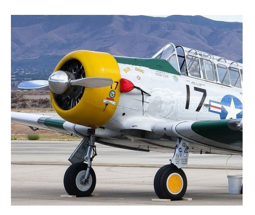
North American T6 Carb Air Scoop Cover