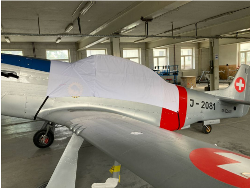
Scalewings SW-51 Mustang Canopy Cover, test fit cover

This cover type is made from Silver Acrylic Sunbrella canvas and is 100% lined with a soft and smooth microfiber. Bruce's Custom Covers developed this material combination especially for aircraft protection. The outer material is medium weight and treated for water resistance, UV resistance and anti-static buildup. The inner lining is a very soft and smooth microfiber to prevent scratching. The material is very reflective, and tests show that the cabin interior temperature can be reduced to near-ambient temperature on the hottest of days. It is water, ice and snow repellent, yet breathable to allow moisture to escape from between the cover and the aircraft surface.