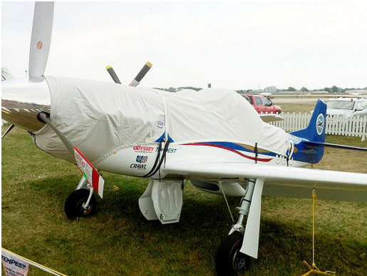
Thunder Mustang Canopy & Engine Cover

This cover type is made from Silver Acrylic Sunbrella canvas and is 100% lined with a soft and smooth microfiber. Bruce's Custom Covers developed this material combination especially for aircraft protection. The outer material is medium weight and treated for water resistance, UV resistance and anti-static buildup. The inner lining is a very soft and smooth microfiber to prevent scratching. The material is very reflective, and tests show that the cabin interior temperature can be reduced to near-ambient temperature on the hottest of days. It is water, ice and snow repellent, yet breathable to allow moisture to escape from between the cover and the aircraft surface.