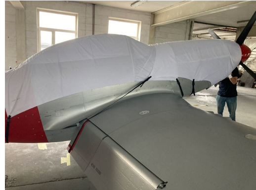
Scalewings SW-51 Mustang Canopy Cover, test fit cover