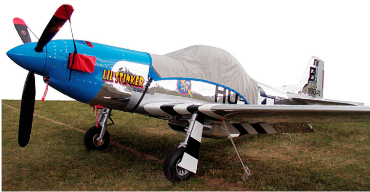
Stewart Mustang Canopy Cover, Prop Tie Downs & Intake Plugs Stewart Mustang Canopy Cover, Prop Tie Downs & Intake Plugs