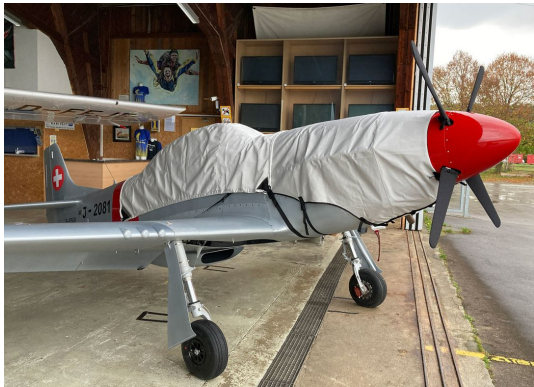
SW-51 Mustang Canopy & Engine Covers

This cover type is made from Silver Acrylic Sunbrella canvas and is 100% lined with a soft and smooth microfiber. Bruce's Custom Covers developed this material combination especially for aircraft protection. The outer material is medium weight and treated for water resistance, UV resistance and anti-static buildup. The inner lining is a very soft and smooth microfiber to prevent scratching. The material is very reflective, and tests show that the cabin interior temperature can be reduced to near-ambient temperature on the hottest of days. It is water, ice and snow repellent, yet breathable to allow moisture to escape from between the cover and the aircraft surface.