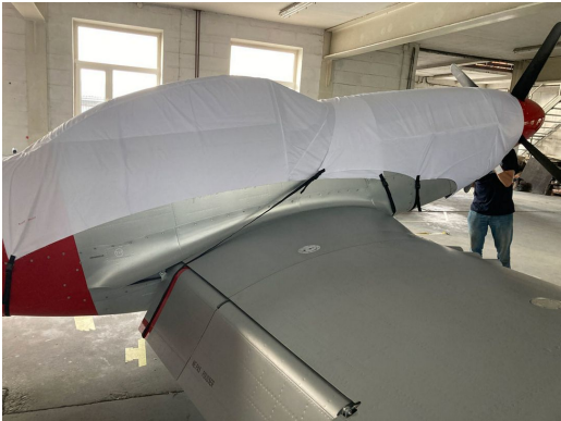
Scalewings SW-51 Mustang Canopy & Engine Covers, test fit covers