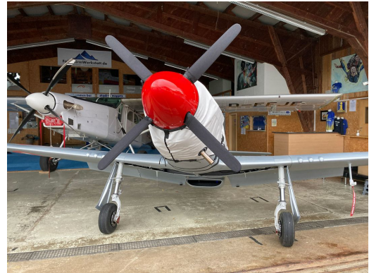
SW-51 Mustang Engine Cover