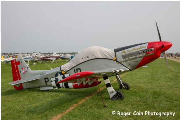
Titan Mustang Canopy Cover