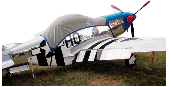
Stewart Mustang Canopy Cover, Prop Tie Downs & Intake Plugs Stewart Mustang Canopy Cover, Prop Tie Downs & Intake Plugs