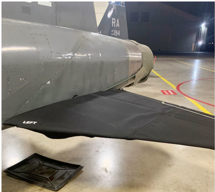
Northrop T-38 Horizontal Stabilizer Cover