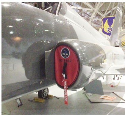
Northrop Grumman T38-C Intake Plugs

The Engine Inlet Plugs are custom fit for your Northrop Talon T-38 Trainer intakes, made with heavy-duty vinyl material, and stuffed with a single block of sculpted urethane foam. Each plug has a zipper that allows the foam to be removed and dried if necessary. Engine plugs have 'remove before flight' streamers sewn onto the face of the plugs. Most plugs are imprinted with the aircraft registration number in black for an extra charge. Storage bag NOT included. Engine plugs may be inserted after flight when the engine is still warm. Engine Inlet Plugs are commonly referred to as Cowl Plugs, Intake Plugs, Cowl Blocks, Engine Blocks, and Engine Bungs.