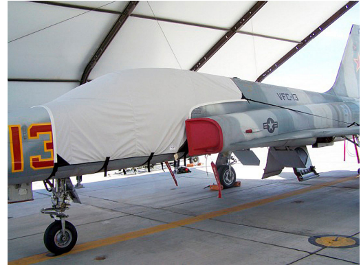
Northup F5 Talon Canopy Cover