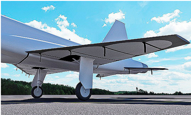
T-38 Talon Wing and Horizontal Stabilizer Covers (3D Rendering)

WINTER USE MATERIAL - Made with Solution-Dyed Polyester fabric, this option is intended for seasonal use to aid in deicing, rain mitigation, or for occasional travel. The material is lighter and more compact, but more susceptible to UV damage and may have a shorter useful life if used continuously outside than the all-year use material.