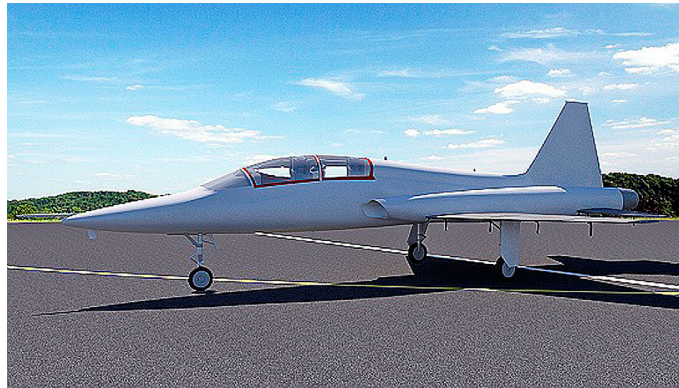
T-38 Talon Wing and Horizontal Stabilizer Covers (3D Rendering)