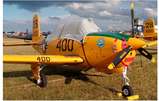
T34 Canopy Cover & Engine Inlet Plugs