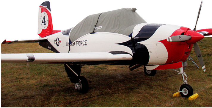
T34 Canopy Cover

This cover type is made from Silver Acrylic Sunbrella canvas and is 100% lined with a soft and smooth microfiber. Bruce's Custom Covers developed this material combination especially for aircraft protection. The outer material is medium weight and treated for water resistance, UV resistance and anti-static buildup. The inner lining is a very soft and smooth microfiber to prevent scratching. The material is very reflective, and tests show that the cabin interior temperature can be reduced to near-ambient temperature on the hottest of days. It is water, ice and snow repellent, yet breathable to allow moisture to escape from between the cover and the aircraft surface.