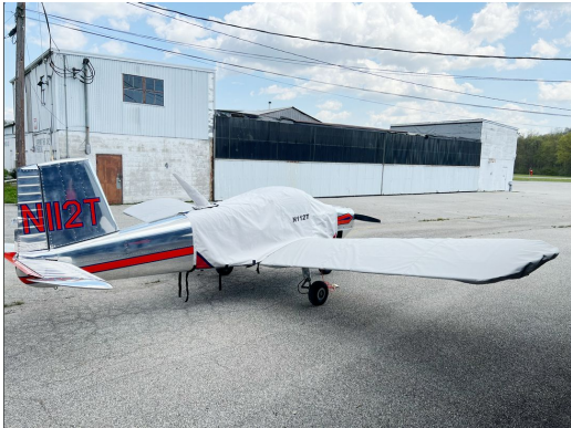
Thorp Sky Scooter Extended Canopy Cover & Wing Covers

This cover type is made from Silver Acrylic Sunbrella canvas and is 100% lined with a soft and smooth microfiber. Bruce's Custom Covers developed this material combination especially for aircraft protection. The outer material is medium weight and treated for water resistance, UV resistance and anti-static buildup. The inner lining is a very soft and smooth microfiber to prevent scratching. The material is very reflective, and tests show that the cabin interior temperature can be reduced to near-ambient temperature on the hottest of days. It is water, ice and snow repellent, yet breathable to allow moisture to escape from between the cover and the aircraft surface.