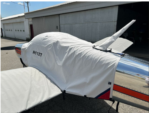
Thorp Sky Scooter Extended Canopy Cover & Wing Covers