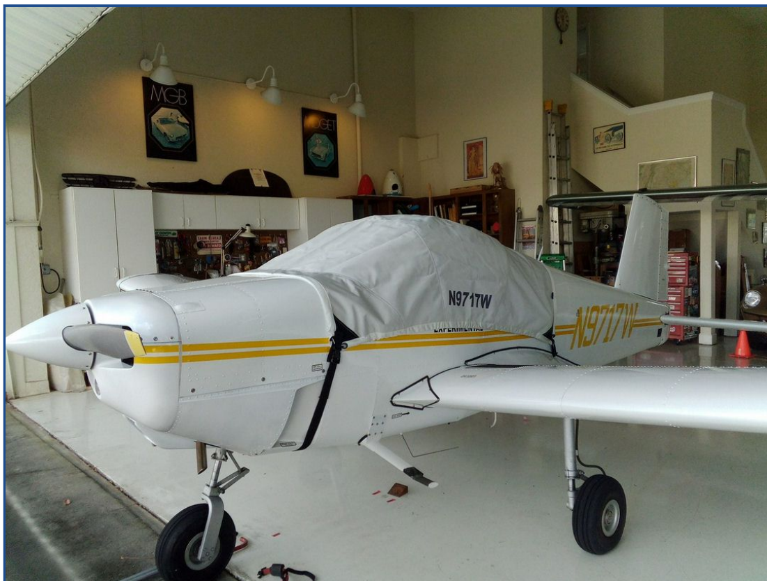
Thorp Sky Scooter T211 Canopy Cover