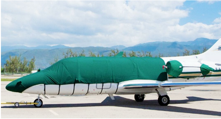
Raytheon Beechjet 400 Fuselage/Nose Cover, Engine Covers

This cover type is made from Silver Acrylic Sunbrella canvas and is 100% lined with a soft and smooth microfiber. Bruce's Custom Covers developed this material combination especially for aircraft protection. The outer material is medium weight and treated for water resistance, UV resistance and anti-static buildup. The inner lining is a very soft and smooth microfiber to prevent scratching. The material is very reflective, and tests show that the cabin interior temperature can be reduced to near-ambient temperature on the hottest of days. It is water, ice and snow repellent, yet breathable to allow moisture to escape from between the cover and the aircraft surface.