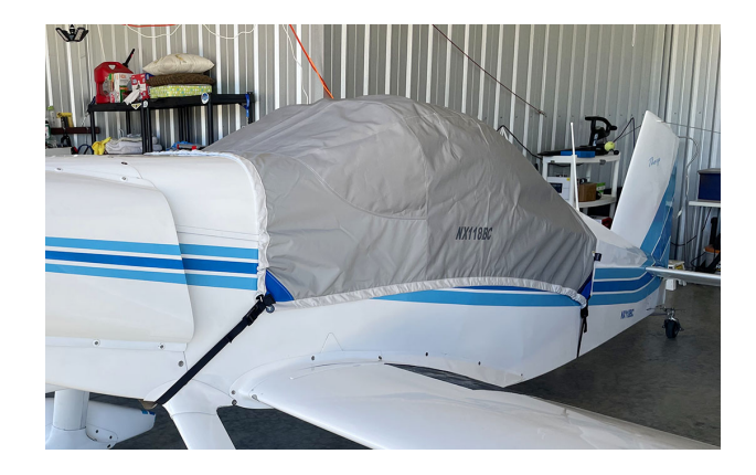
T-18 Travel Cover, Light Weight Canopy Cover (Bubble Canopy)

Travel Covers are made with Silver Solution-Dyed Polyester fabric and only lined over the windshield to save weight. The material is lightweight and more compact for easy stowage in the aircraft. The polyester material is water resistant, but only intended for occasional use outside. We also have an ultra lightweight material available for fitted hangar dust covers. For daily outdoor use, the non-travel Sunbrella Cover is the best choice.