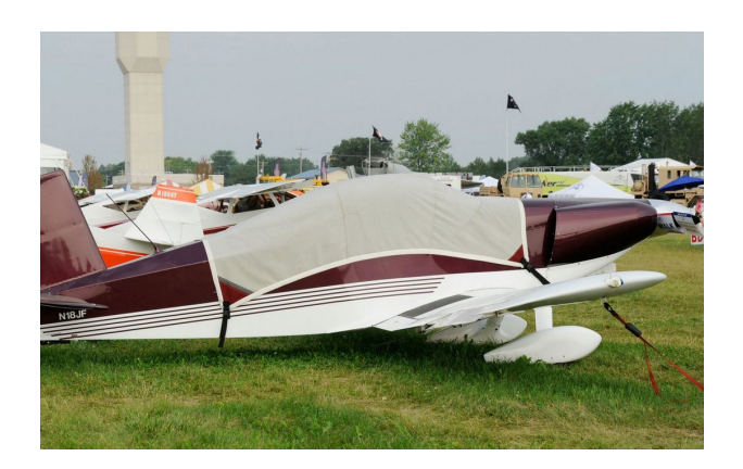
Bushby Mustang Complete Fuselage Cover with Detachable Wing Covers