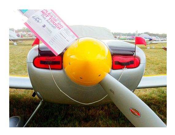
Vans's RV-7 Engine Engine Inlet Plugs