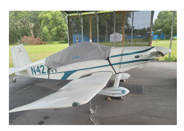
Thorp T-18 Travel Cover